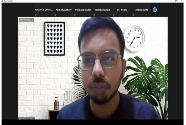
Webinar on Status of Tribes and Tribal Economic Perspective, August 8,2021