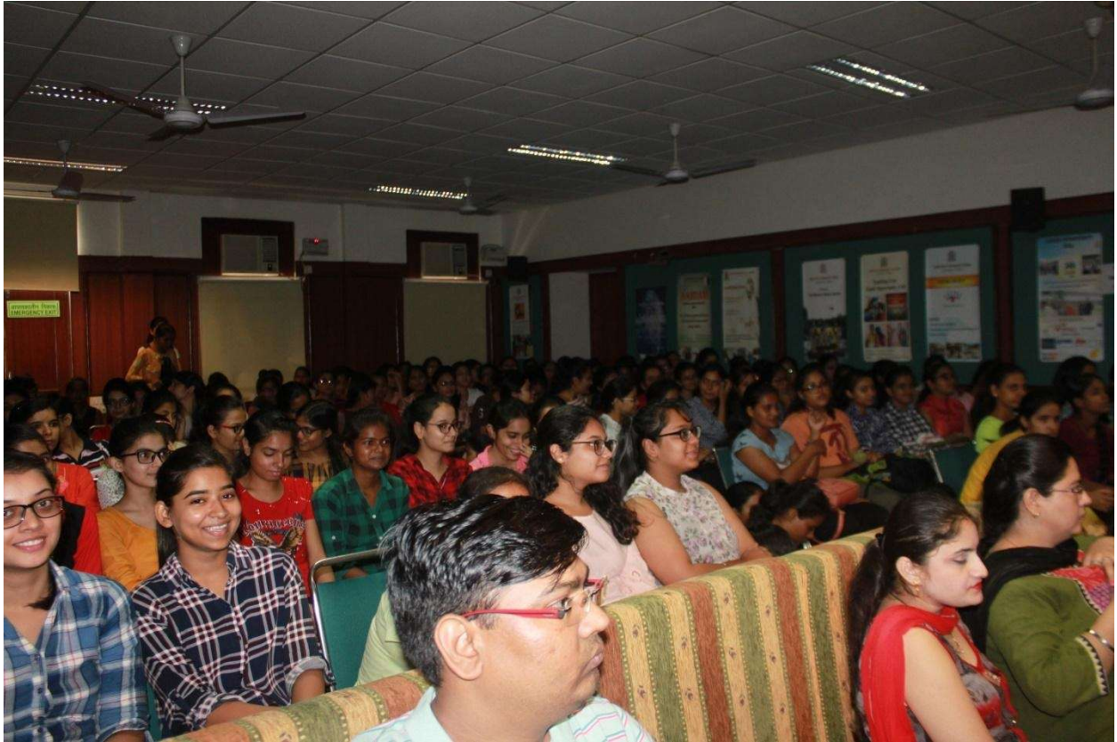
Movie Screening - September 6 th , 2018