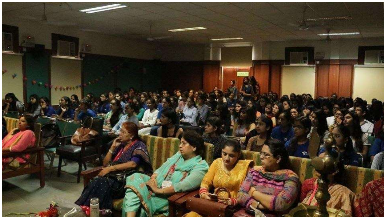
Annual Inter-College Departmental Festival 'SIGMA' - November 1, 2018

A Career Counseling Session in collaboration with Career Endeavour Institute was organised on October 26 th , 2018. It focused on how to prepare for IIT-JAM for admission in Masters in Mathematics.