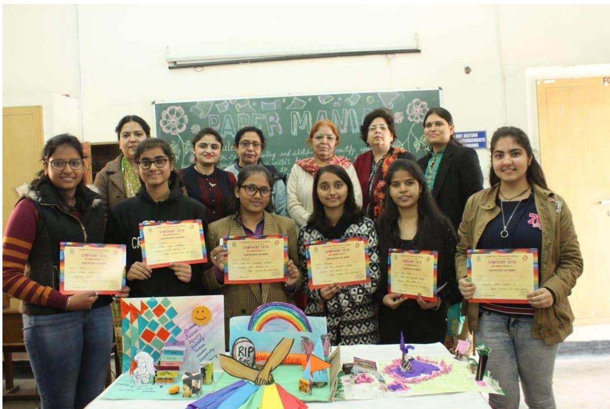
Paper-Mania - January 9 th , 2019