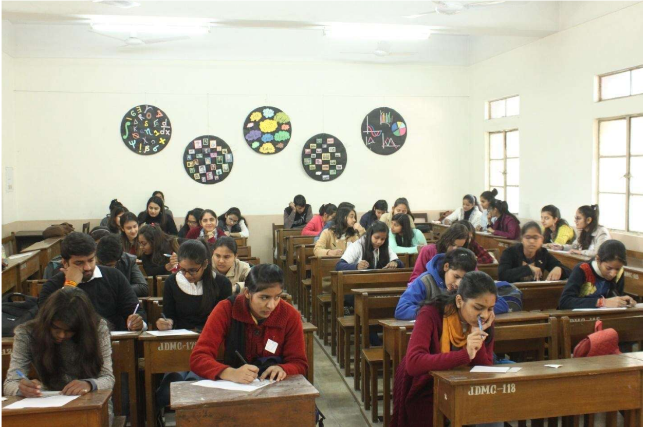
MathBola–The Mathematical Tambola-January 10 th , 2019