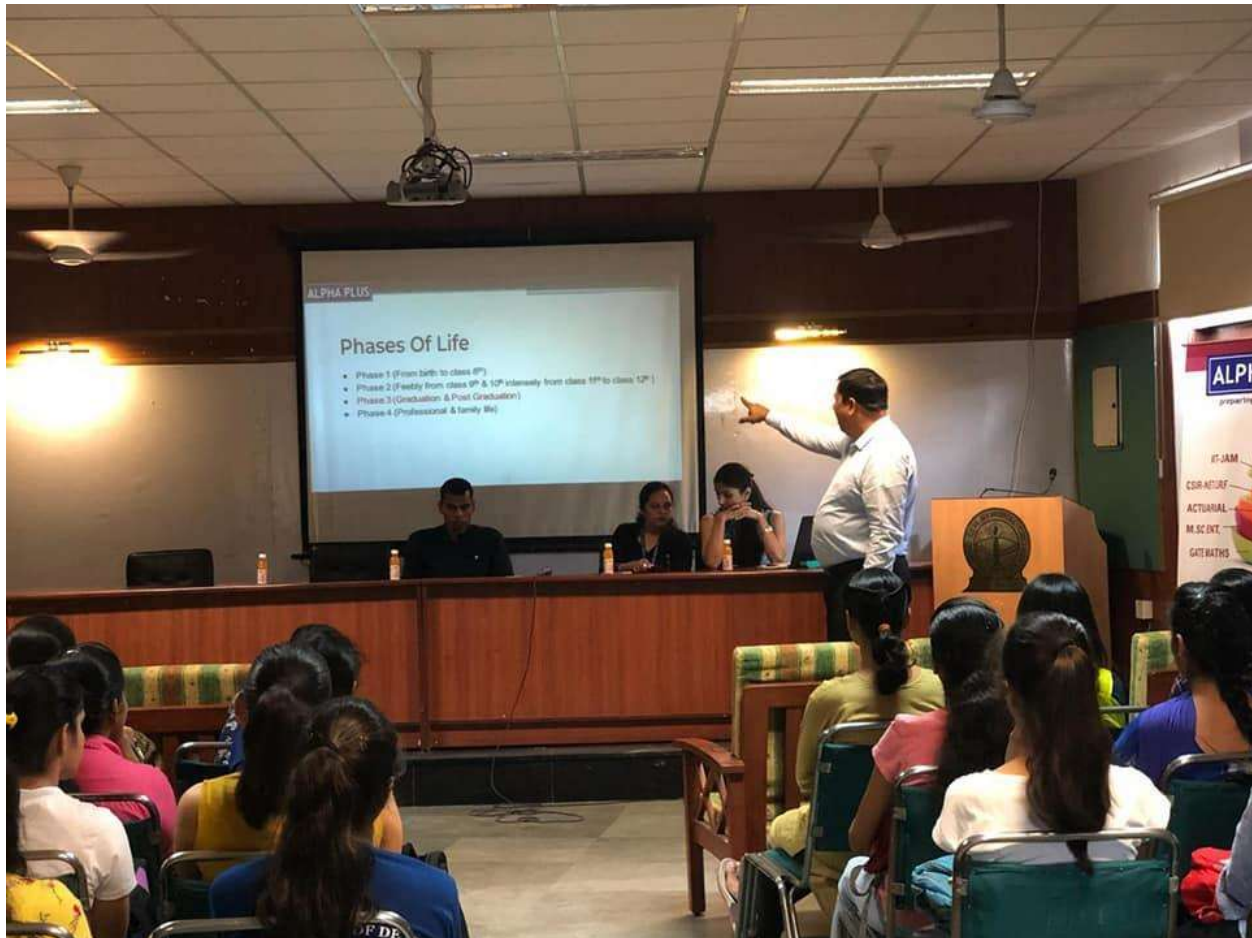
Career Counseling Session with Alpha Plus- October 11th, 2018.

A Career Counseling Session in collaboration with Alpha Plus was organised on October 11 th , 2018. The purpose of this session was to make students aware of various career options after graduating in Mathematics.