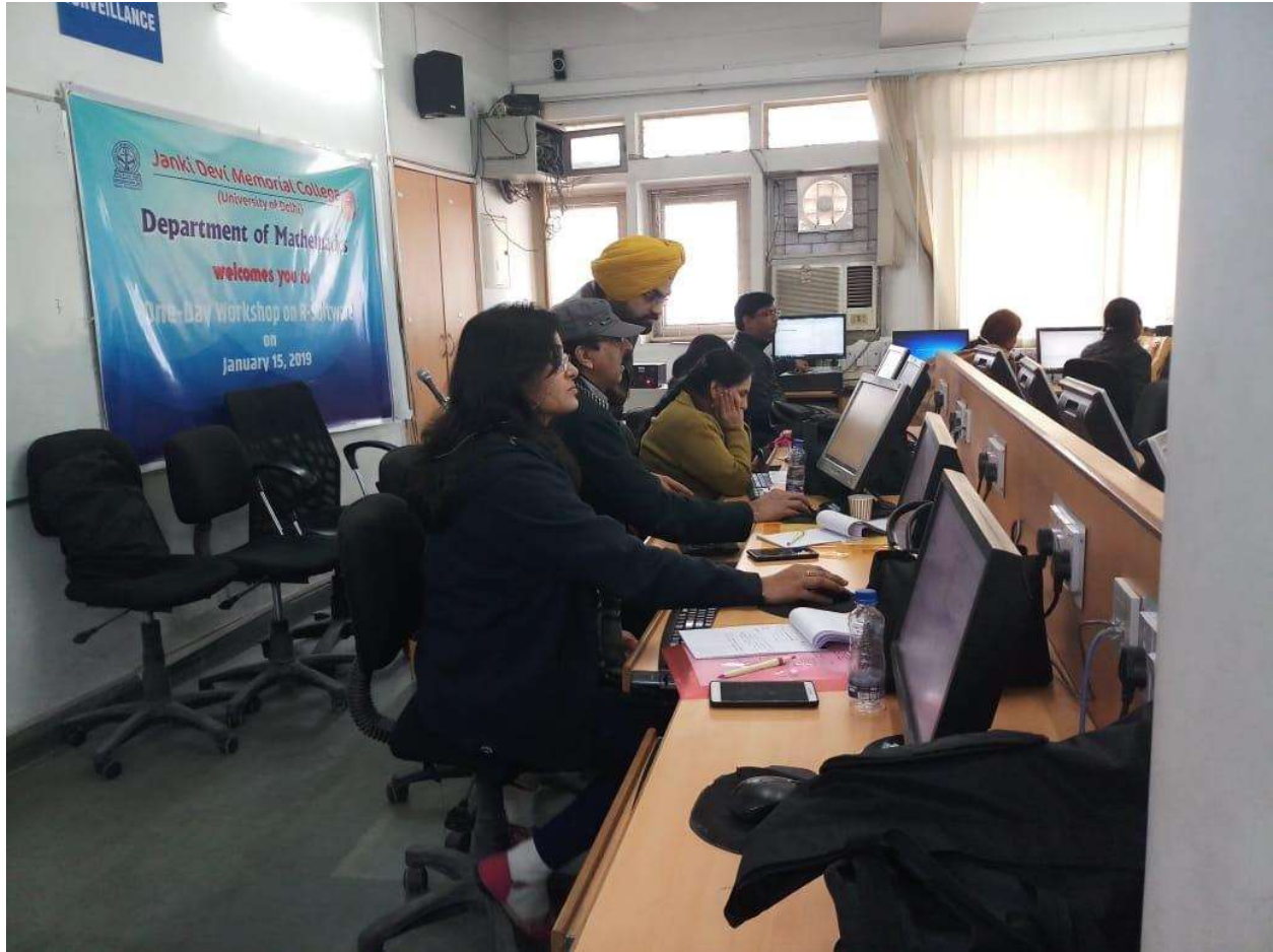
One-Day workshop on R-software - January 15th, 2019

Two events were organised during the Annual Cultural Inter College Festival, 'Symphony-2019' which are as follows: