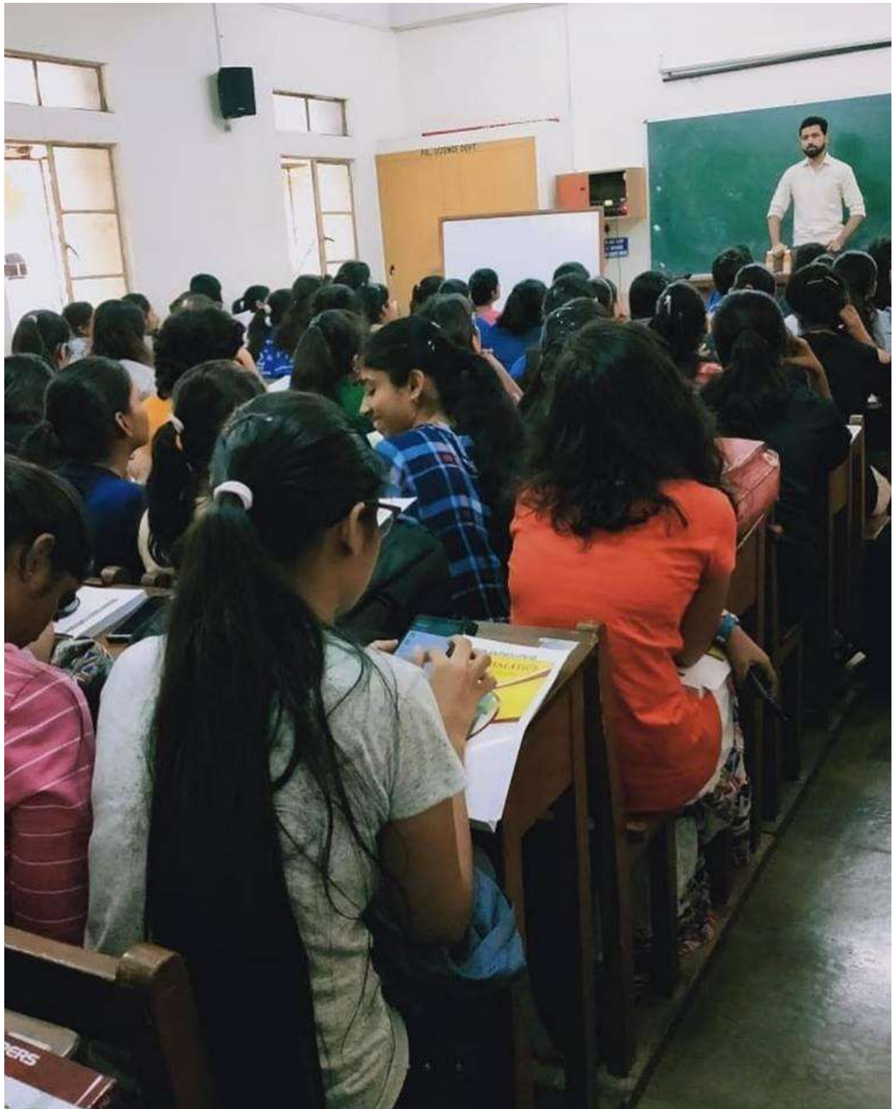
Career Counseling Session with Career Endeavour Institute - October 26th, 2018.