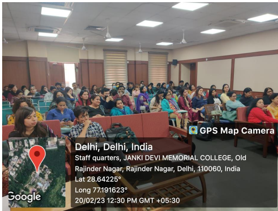
A Glimpse from the Faculty Pedagogy Series Lecture held on 20 February 2023