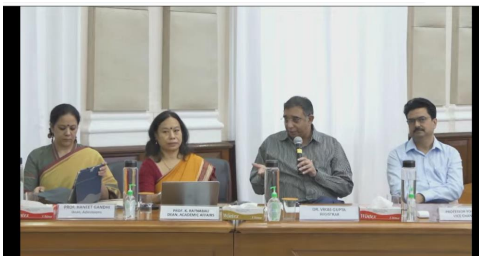
University team that took Session on 23 rd September