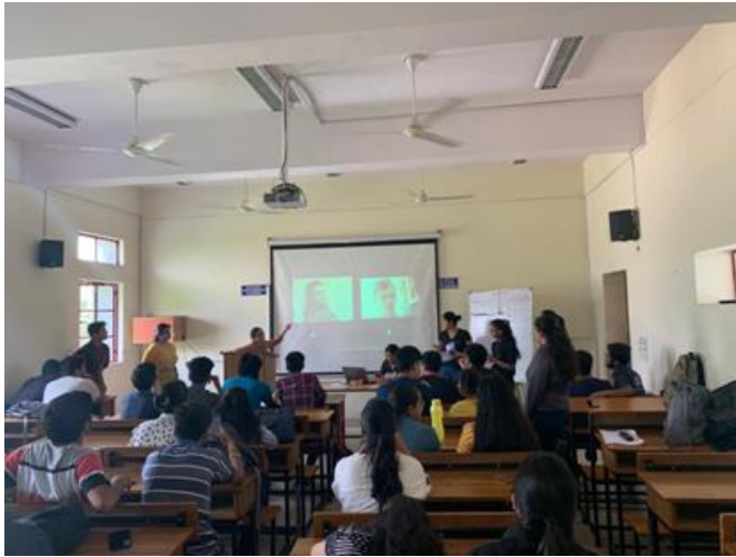
Quizonics 2019: Event Underway