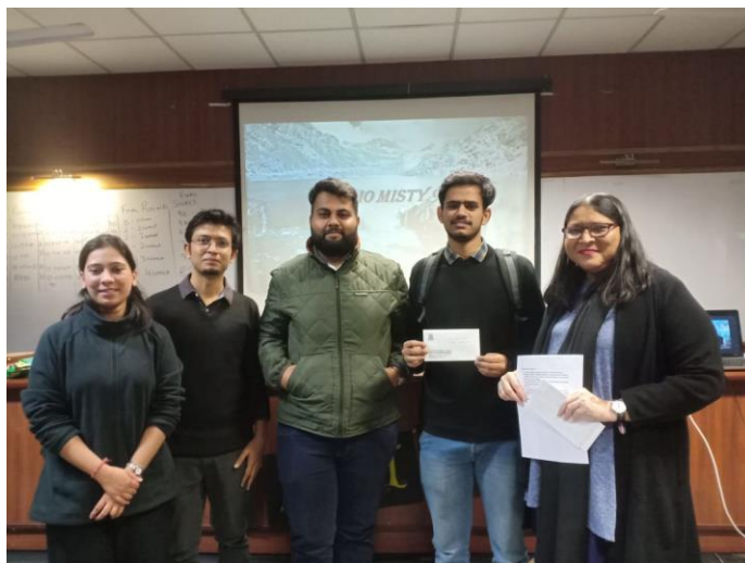
Prize winners for Q&A 2019