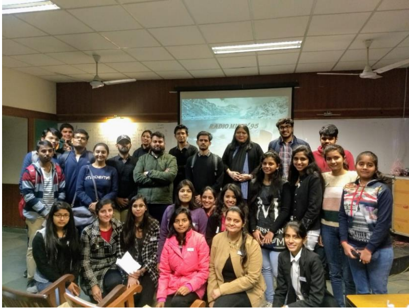
InQuizition team with all the Prize Winners: Q&A 2019