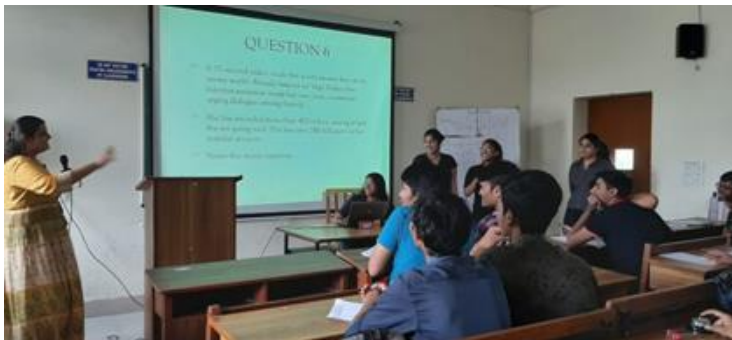
Final Round of Quizonics 2019