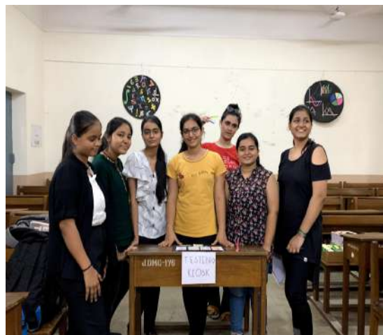
Team Innovators prepared their props for testing

The second day of the workshop commenced with dividing the students into teams by the speaker. The teams were asked to brainstorm ideas, and then pick the best ideas from the available lot, based on their feasibility and budget constraints. Then the students were asked to prepare the props that will be used for testing the feasibility of their ideas to the target audience. This was the highlight of the second day where the students displayed their creativity.