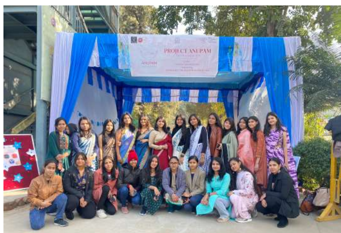
Project Anupam team

For the offline store of Anupam, a stall was put up in the college on pathway, near the college auditorium from 10th - 13th January, 2023, for the creators to showcase the line of products they are willing to sell to the customers. The 17 creators had their share of days on which they were entitled to put up their products in the stalls. To promote the stalls, reels were shot and posters were circulated throughout social media. The stall was decorated with handmade, colourful placards, flowers, etc.