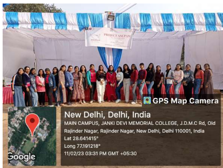
Team Anupam with the creators

Project Anupam - An initiative by Impreneurs, the Entrepreneurship Cell set up its offline store on 11th February 2023 on the occasion of Alumnae Meet, 2023 organised by the Students Union of Janki Devi Memorial College. The store was set up in the college ground from 3 PM to 5 PM.