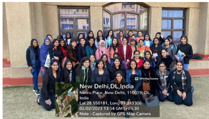
Team Anupam at Eros Hotel

Project Anupam team members went to Eros Hotel on 2nd February at Eros Hotel for a sponsorship task. Everyone gathered at the Nehru place metro station. From there, they all went to Eros Hotel. An event was being organised by Eros, wherein, many universities from the United Kingdom came to offer courses from abroad to the students at stipulated packages. We had to interact with them and had to gather information about their courses, fees structure, placements, admission procedure, scholarships, etc. A team of 60 students went to do the task of Eros hotel. Through this task, our team got 300/- for each student who participated in the task. In total, we were able to generator 15,000/-.