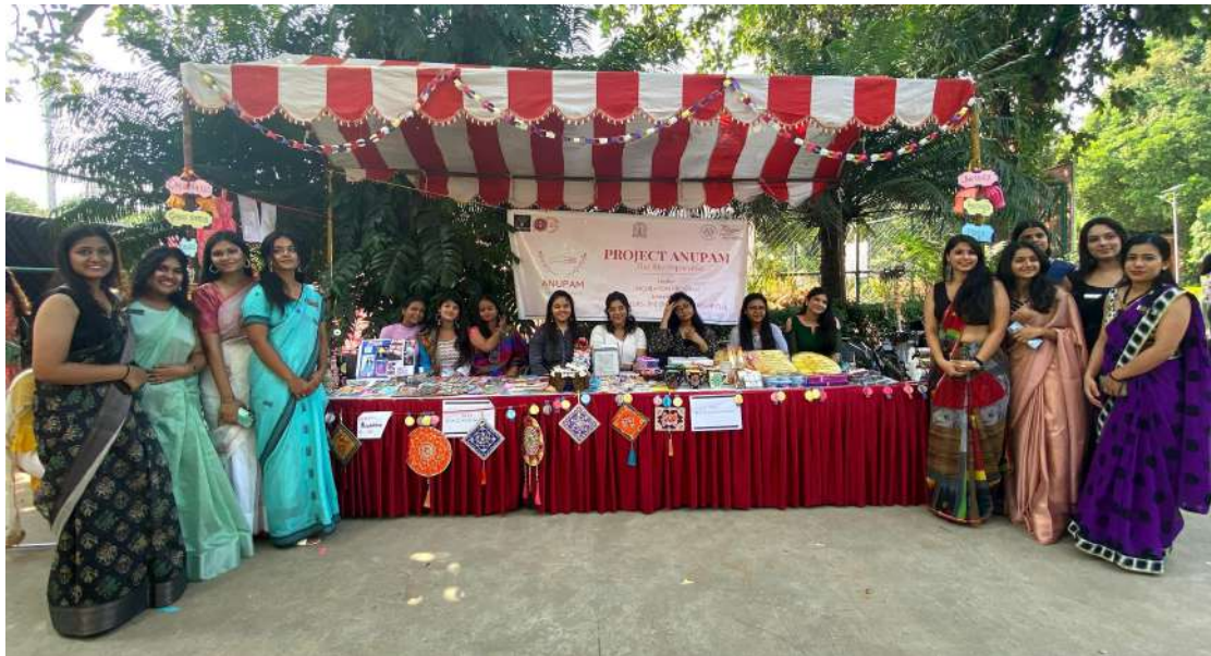
Team Anupam with our creators