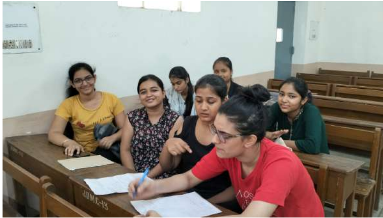
The teams brainstorming their ideas

The second day of the workshop commenced with dividing the students into teams by the speaker. The teams were asked to brainstorm ideas, and then pick the best ideas from the available lot, based on their feasibility and budget constraints. Then the students were asked to prepare the props that will be used for testing the feasibility of their ideas to the target audience. This was the highlight of the second day where the students displayed their creativity.