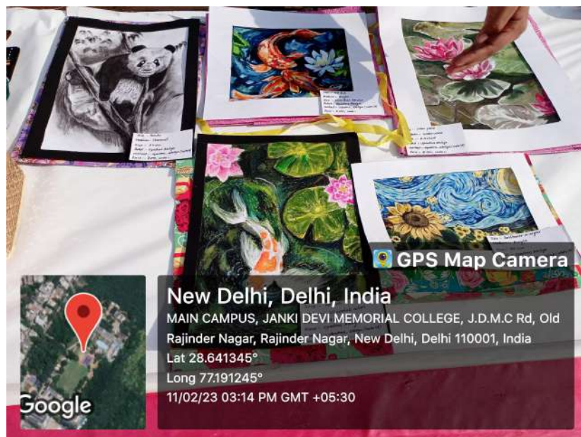
Products by the creators of Project Anupam