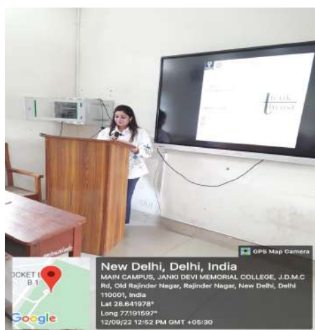
The speaker addressing the students