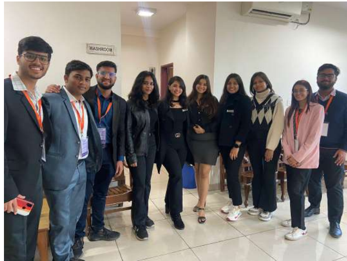
Team Anupam with the team of Ramanujan College