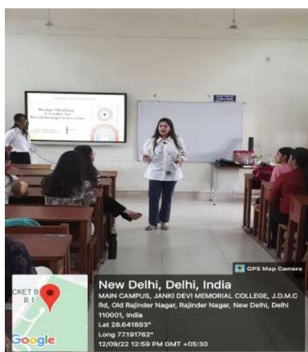
The speaker interacting with the students