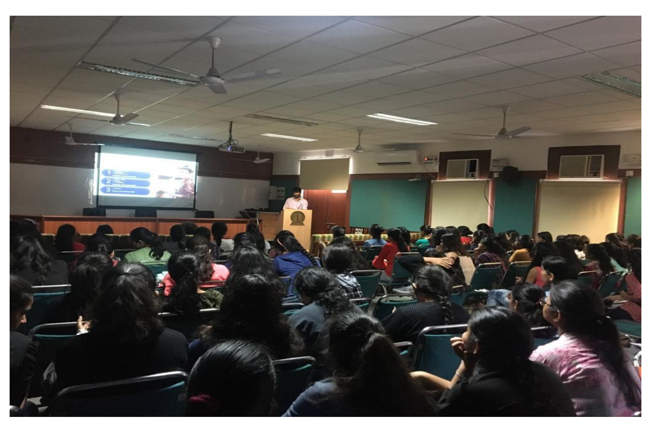
Talk on Young Leaders Program on 5th March, 2020