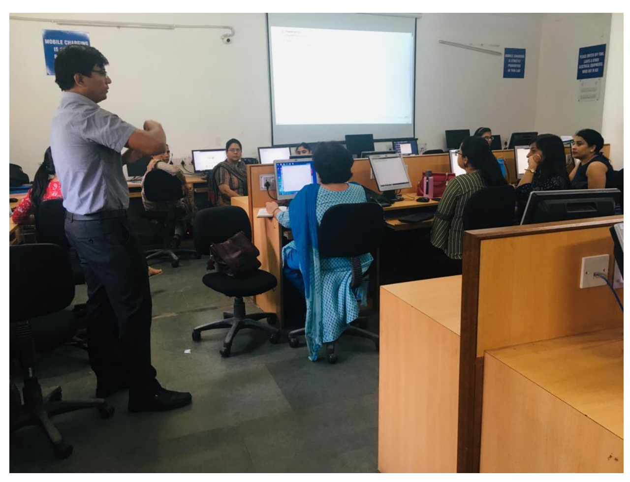
Introduction to Wolfram Mathematica 12.0 on August 2<sup>nd</sup>, 2019