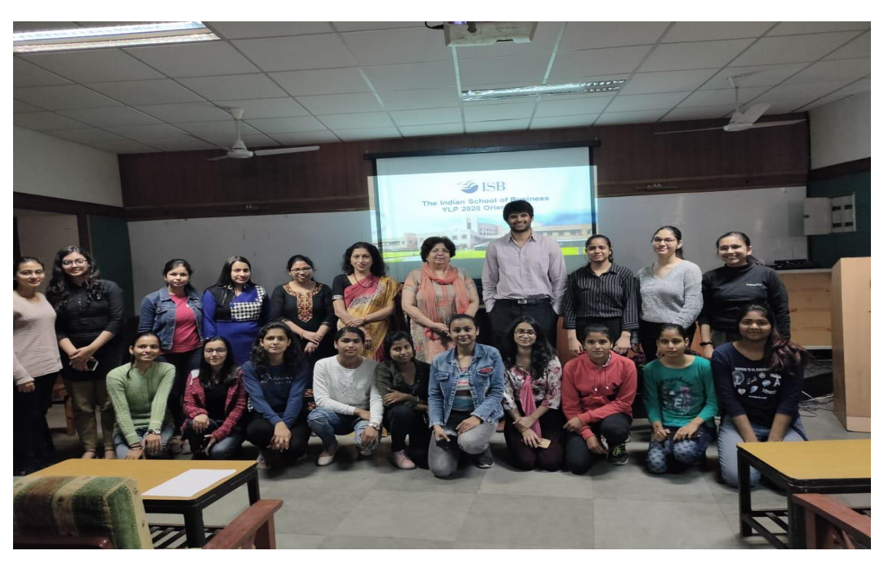
Talk on Young Leaders Program on 5<sup>th</sup> March, 2020