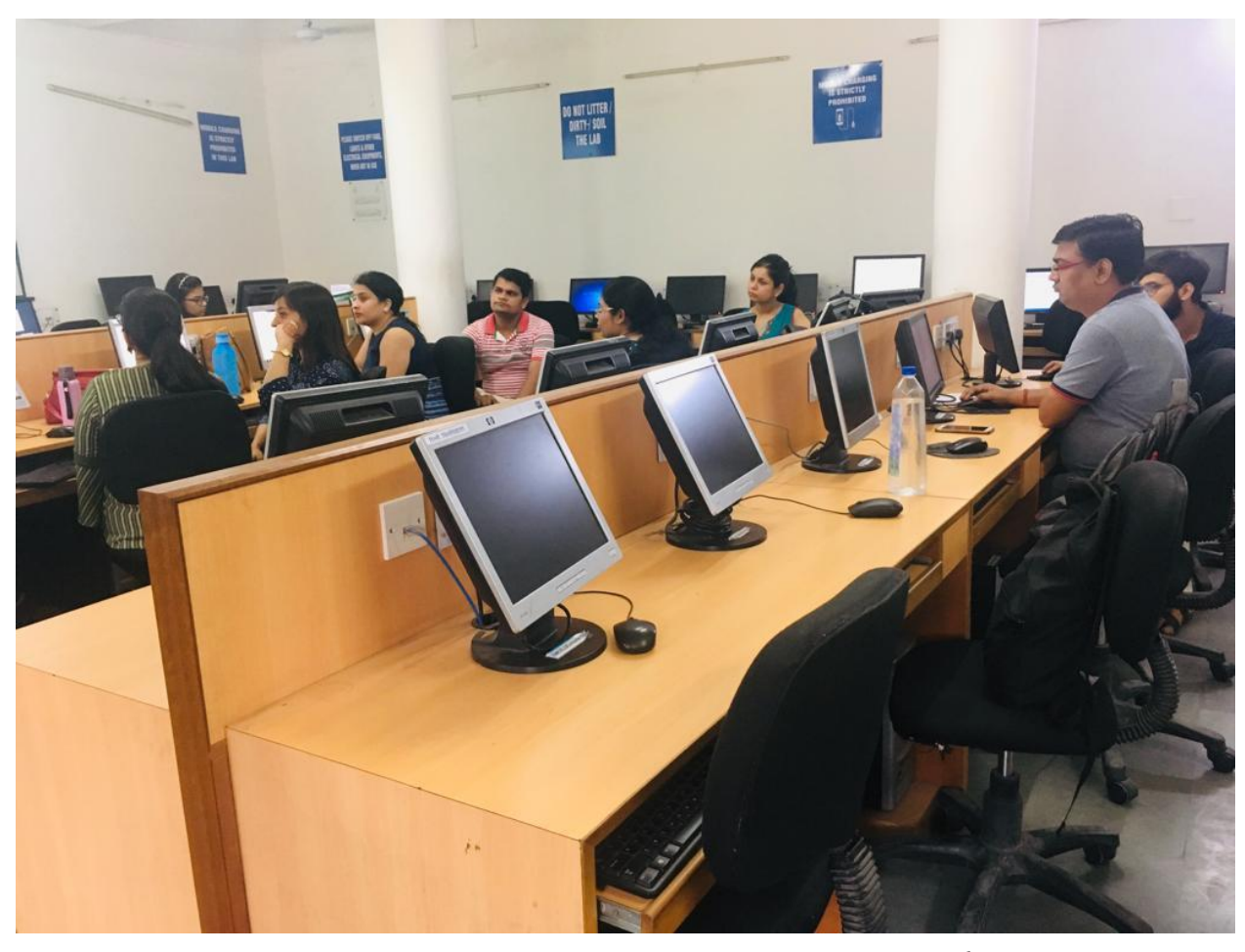
Introduction\ to\ Wolfram\ Mathematica\ 12.0\ on\ August\ 2^{nd},\ 2019