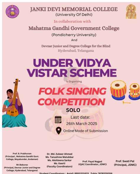
(Poster of the Competition)

This event not only celebrated the richness of folk music but also strengthened the academic and cultural ties between the collaborating institutions. The faculty coordinators and student organizers played a crucial role in ensuring the smooth execution of the competition. Such initiatives under the Vidya Vistar Scheme continue to enhance inter-institutional learning and cultural appreciation.