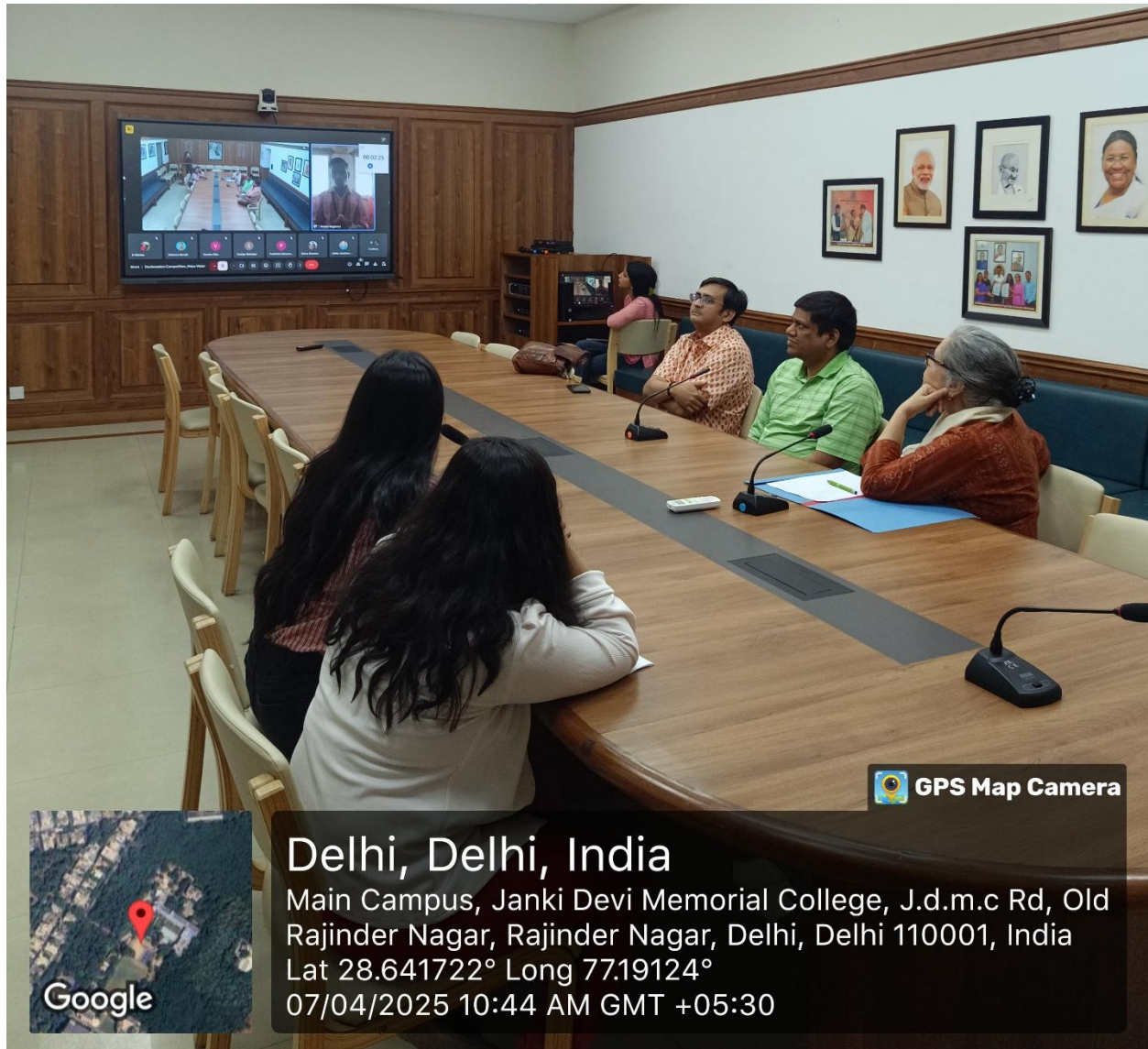
Geotagged pictures of the competition