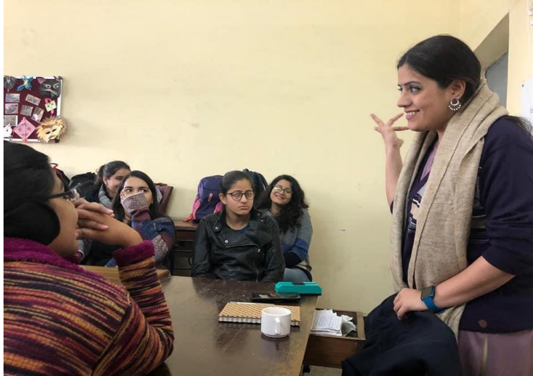
Workshop on consent and healthy relationships – 22 nd January, 2020