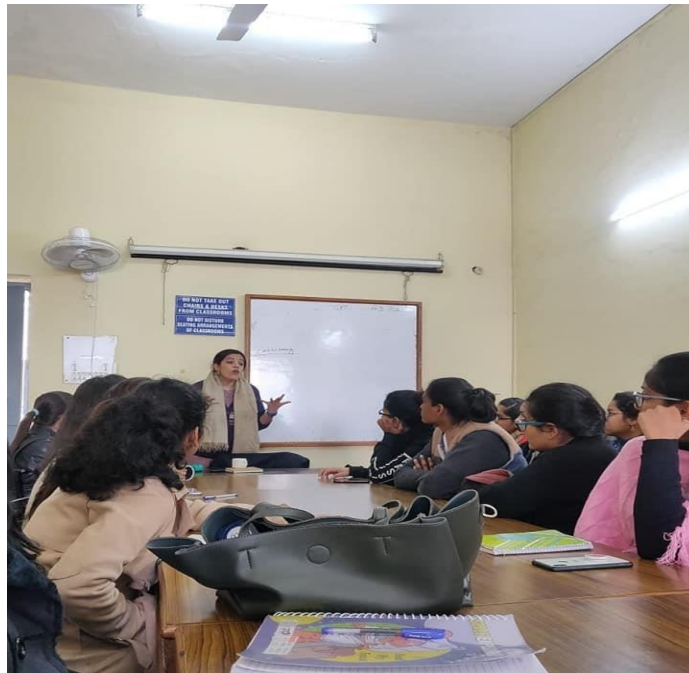
Workshop on consent and healthy relationships – 22 nd January, 2020