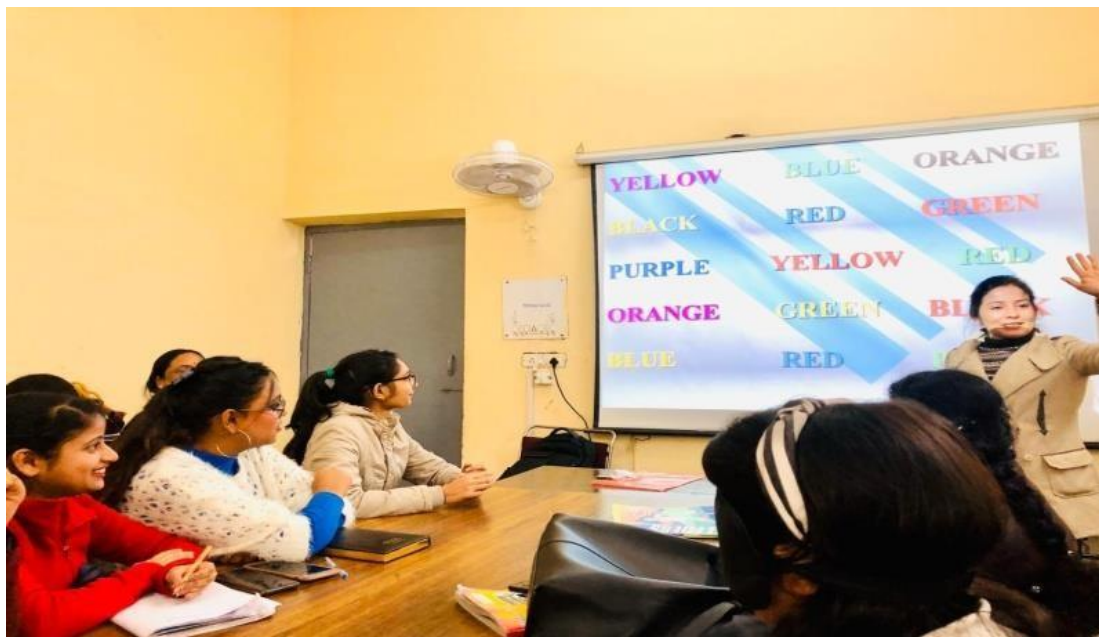
Demystifying Disability and inclusion - 20 th January, 2020

– Workshop on puppet and mask making - 15 th January, 2020