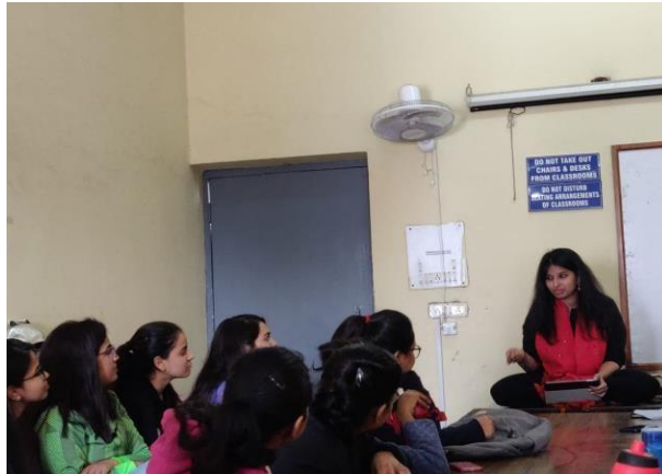
Workshop on Distressing Stress – 5 th February, 2020