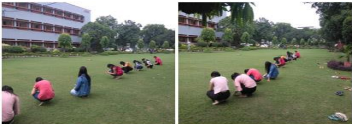
Field Activity: The Butterfly and Insect Count, September 19, 2019

On September 19, 2019 as a part of the course Environmental Sociology, the third year students of the Sociology Department did a field activity entailing butterfly and insect count. The activity was done in the gardens of the Janki Devi Memorial College. The activity was an enriching and thrilling experience for the students as they learnt regarding various insects and bugs in the environs around them of which they have been oblivious. It provides a good example of innovative pedagogy as it took students outside classroom and allowed them to establish a connection between theory and practice.