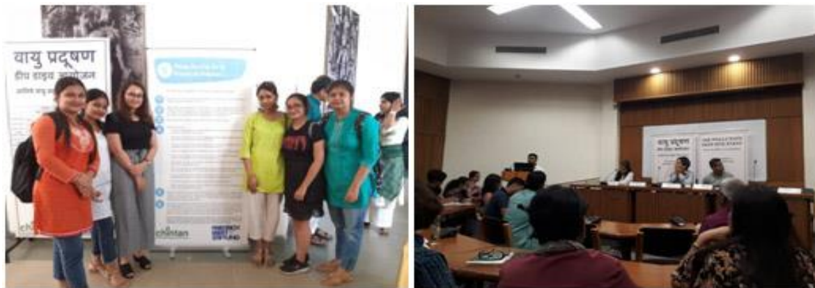
Sociology Students Attend Seminar Organised by Chintan, August 9, 2019

The Environmental Research and Action group, Chintan conducted a seminar titled Deep Dive Event on Air Pollution at India International Centre, on August 9, 2019 in which speakers from varied fields of study expressed their views. It was a privilege for a team of six students from the Sociology Department, Janki Devi Memorial College to attend the seminar. As residents of Delhi, which is one of the most polluted cities in India, the students found it extremely enriching and informative to learn regarding the problem of air pollution. The seminar covered various aspects of air pollution- its causes, its impact on human health, property, plant and animal life and the laws introduced by government to fight it.