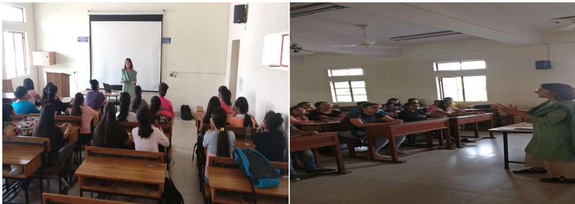
Bystander Intervention Session for Sociology Students, October 24, 2019