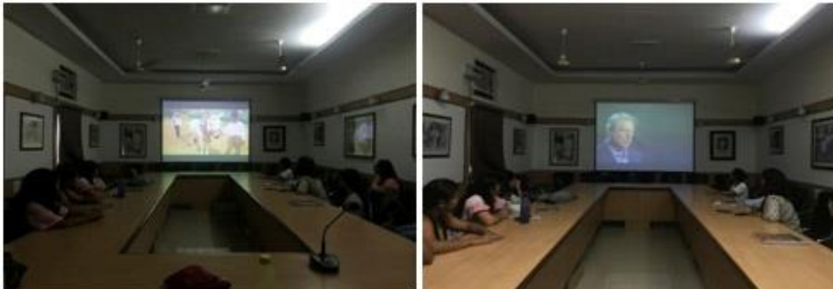
Screening of An Inconvenient Truth, September 12, 2019

On September 12, 2019 the Department of Sociology screened the film An Inconvenient Truth directed by Davis Guggenheim for its third year students in keeping with the requirement for the paper on Environmental Sociology. The students found the film extremely enlightening as it revealed the causes and effects of global-warming and focused on necessary human action to fight it and prevent the earth from dying eventually.