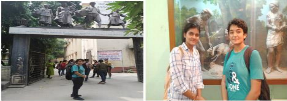
Visit to the Tribal Museum, September 12, 2019