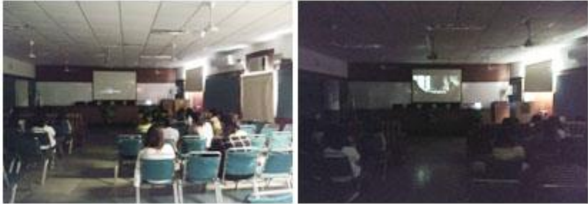
Screening of The Young Karl Marx, September 21, 2019

On September 21, 2019 The Young Karl Marx was screened for the third year students of the Sociology Department as a part of the paper Sociological Thinkers I. The students found the film informative as it illuminated Karl Marx's early life and the major influences on it that had significant implications in shaping of his theoretical insights.