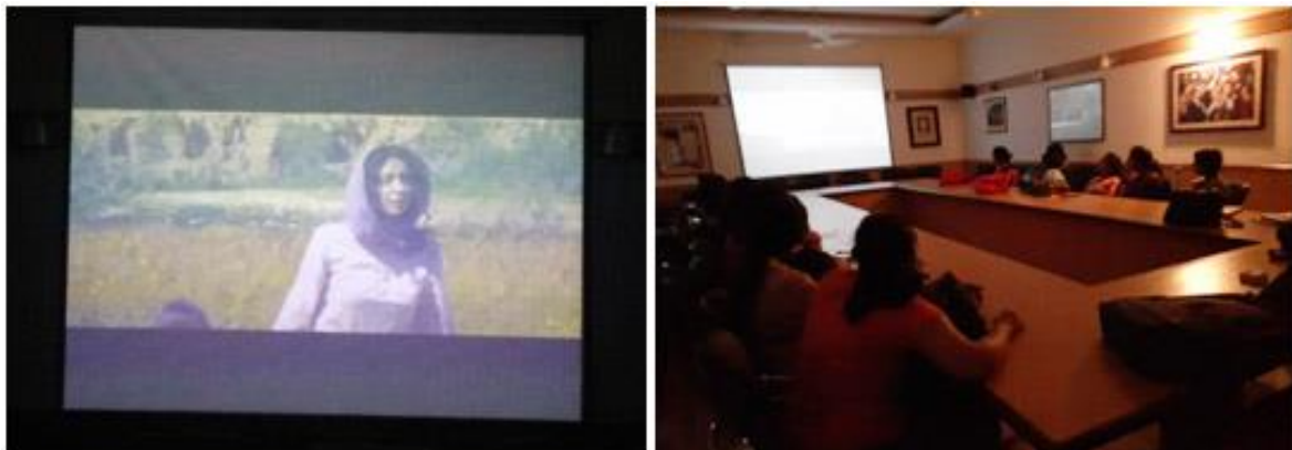
Screening of The Stoning of Soraya, September 7, 2019

The Department of Sociology showed the film The Stoning of Soraya on September 7, 2019 to its second year students in keeping with the course on Sociology of Gender. The students were extremely touched as they learnt through the life of Soraya, the main protagonist in the film about the harsh realities regarding subordinate status of women and gender injustice in society.