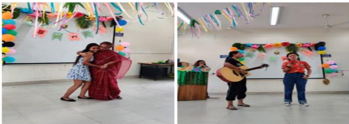
Freshers Welcome Party, August 23, 2019