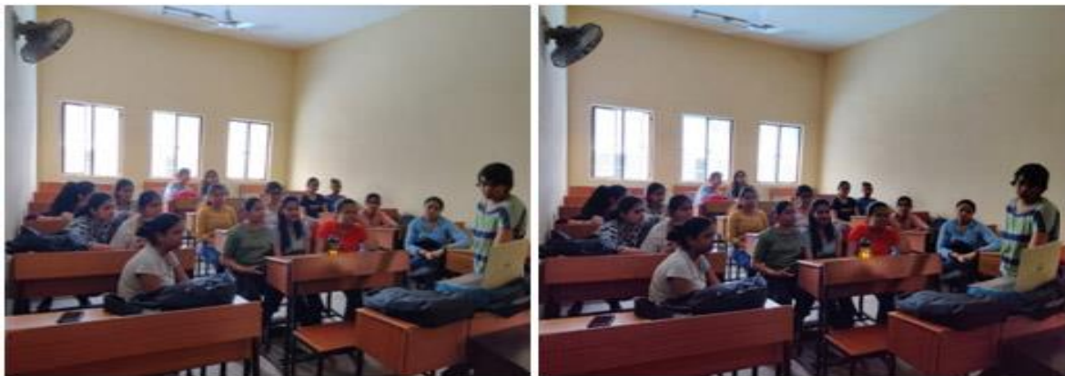
Screening of Period the End of Sentence, September 13, 2021

On September 13, 2019 the students of B.A.(H) Sociology second year watched a short documentary named Period the End of Sentence in keeping with the paper, Sociology of Gender. The documentary talked about the ground realities of stigma of menstruation prevailing in rural India. It focused on a group of local women in the city of Hapur in Uttar Pradesh in India wherein women tried to wipe of the stigma by manufacturing of low cost sanitary pads and strived towards financial independence.