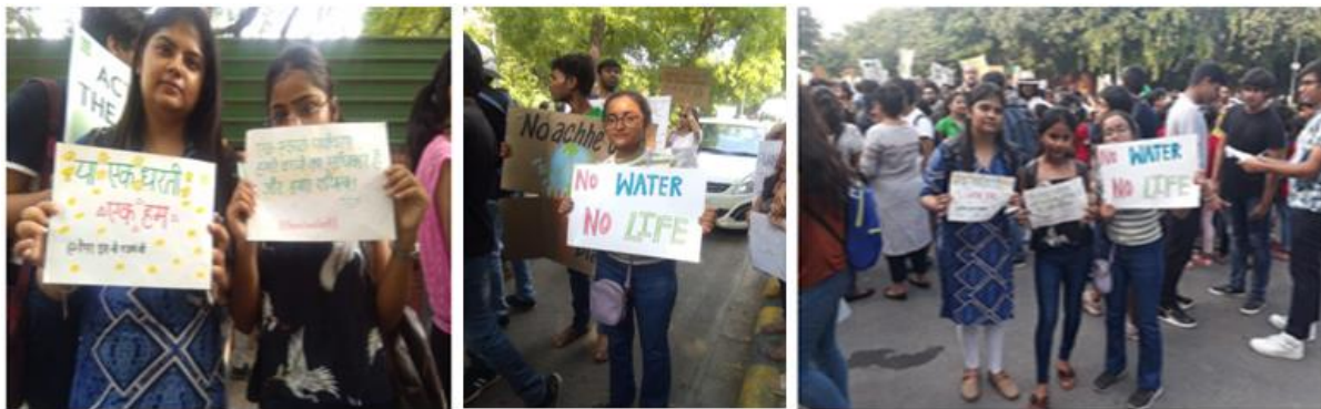
Sociology Students participate in the Climate Strikes, September, 2019