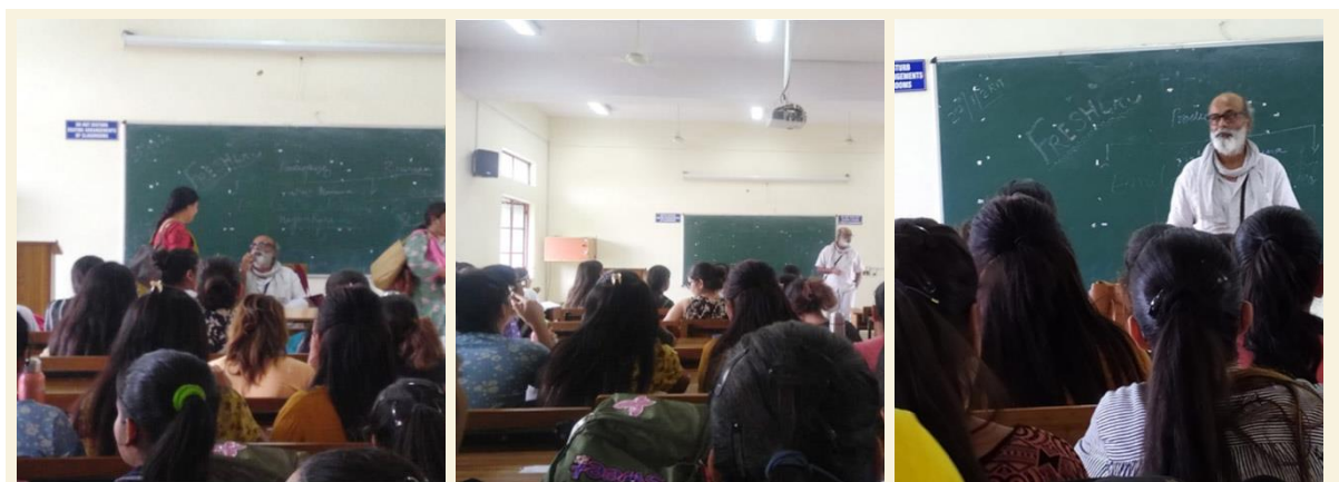
Talk on the Relevance of Classical Social Theory, August 28,2020