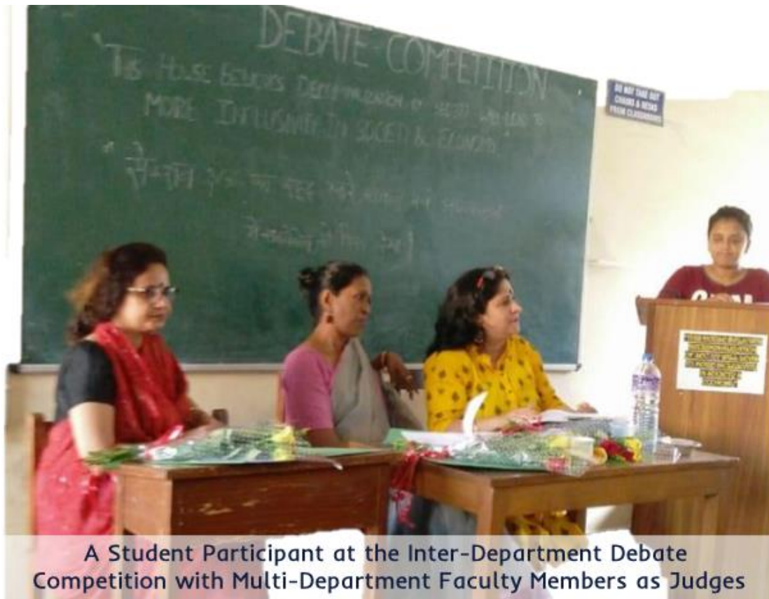
A Student Participant at the Inter-Department Debate Competition with Multi-Department Faculty Members as Judges