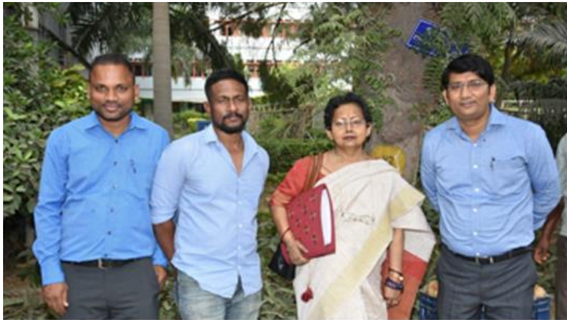
Some Faculty Members of Team Tathastu