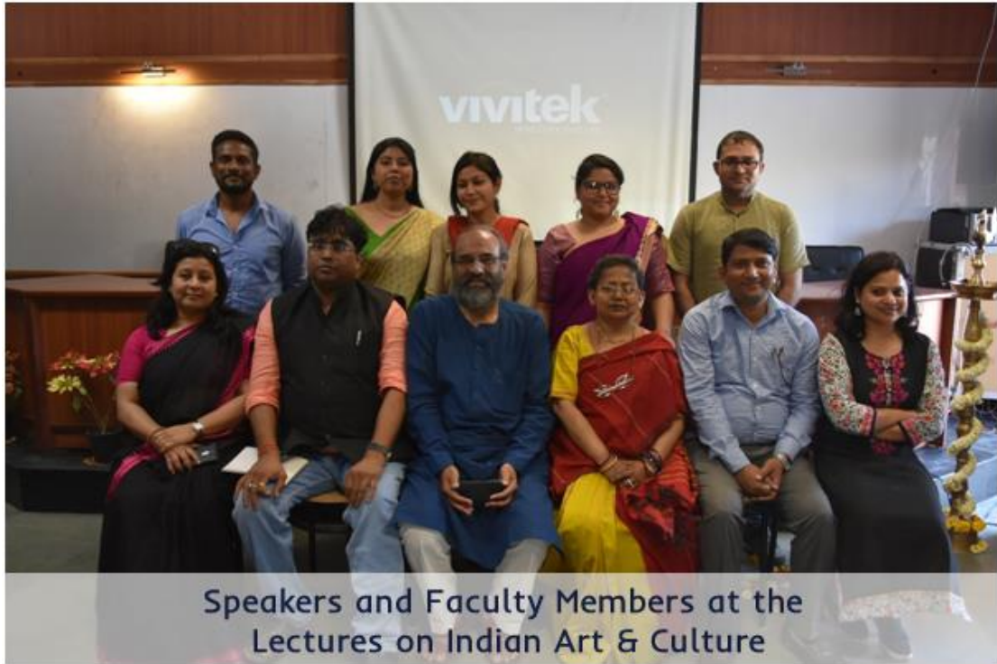
Speakers and Faculty Members at the Lectures on Indian Art & Culture