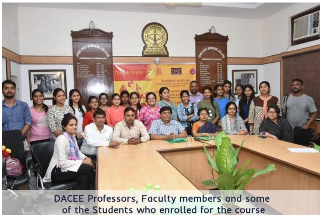
DACEE Professors, Faculty members and some of the Students who enrolled for the course