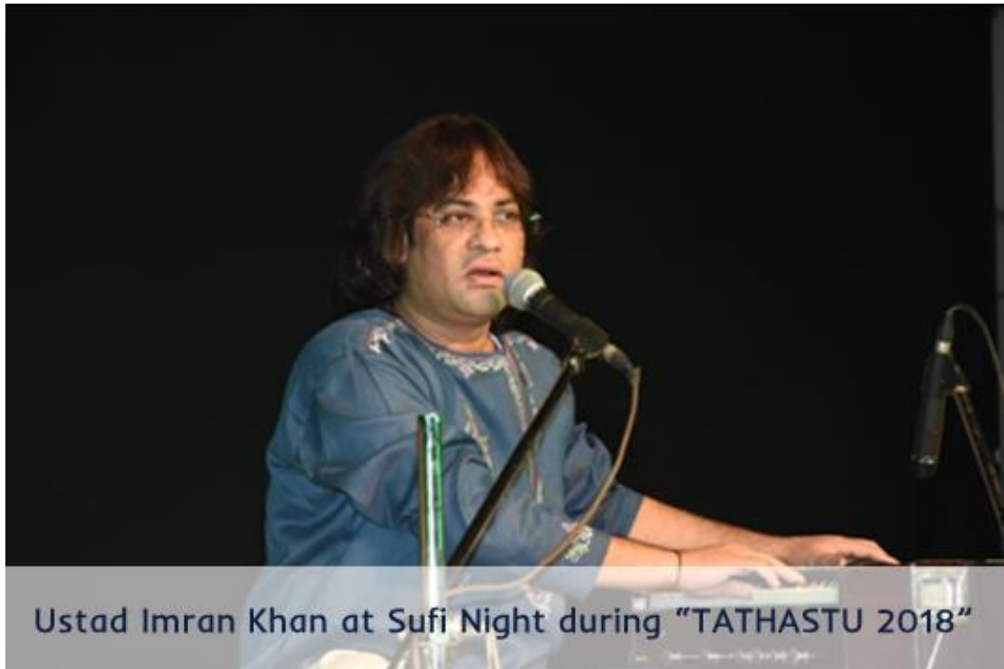
Ustad Imran Khan at Sufi Night during "TATHASTU 2018"