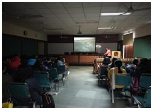
Film -Screening, January 29,2019