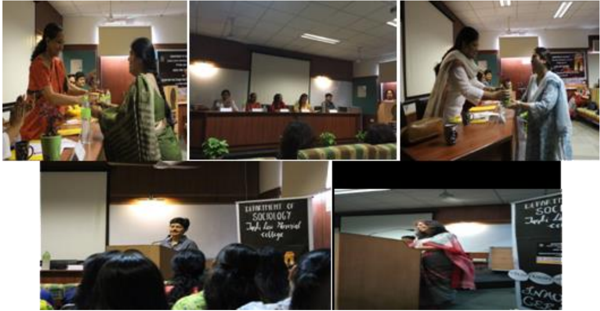
Inaugural Add-on Course August 9, 2018