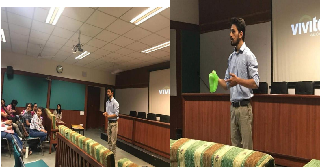
Interactive Session To Fight Plastic Waste, September 22,2018

The Smart Company's green bags are to be sold under the brand name 'smart mom' and 'smart girl'. This led to a healthy debate and discussion between the students and company. A sociologically imaginative and informed understanding of the students became evident as the company was to carry a feedback from them regarding a need to shift to a more gender sensitive brand name as 'smart citizens' for making their green bag project a success.