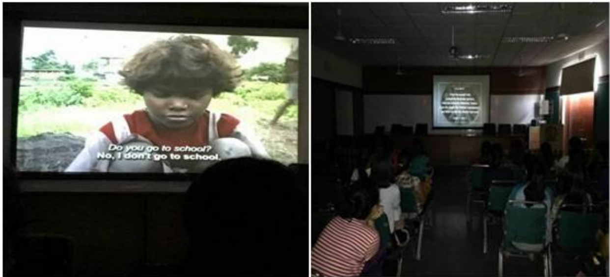
Film Festival August 17, 2018