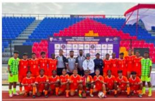
JDMC Football players in Delhi Team for Senior Women National Football Championship in Jaipur, Rajasthan