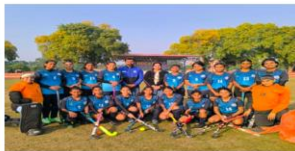
JDMC Hockey players for Inter- University Tournament