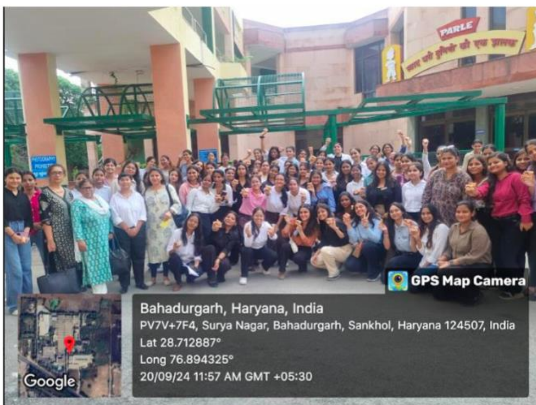
Field visit to Parle G

4.2) Field Visit– Teachers organize field visits to provide students with real-world exposure and additional case studies that help them understand the practical application of theoretical concepts taught in the classroom.