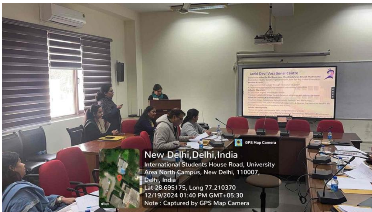
Presentation of the Centre for Skill Enhancement at the Skill Enhancement Course Committee, University of Delhi

emotional intelligence, mindfulness, and scientifically grounded approaches to mental well-being, contributing significantly to students' holistic development.