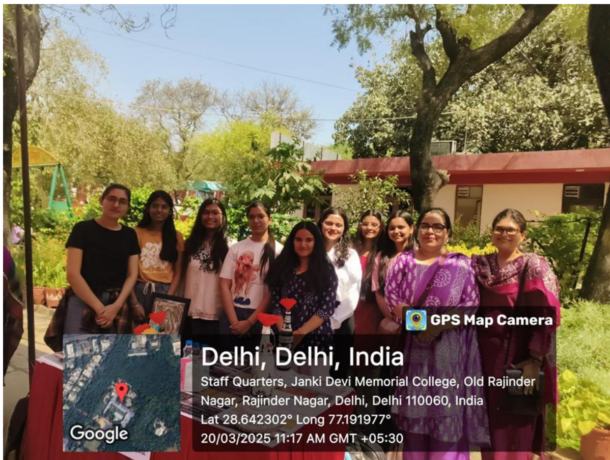
Skill Stall at JDMC

आइ एस ओ 21001 : 2018 व आइ एस ओ 9001 : 2015 प्रमाणित एवं NAAC प्रत्यायित A+ महाविद्यालय An ISO 21001 : 2018 and ISO 9001 : 2015 Certified and NAAC Accredited 'A+' College