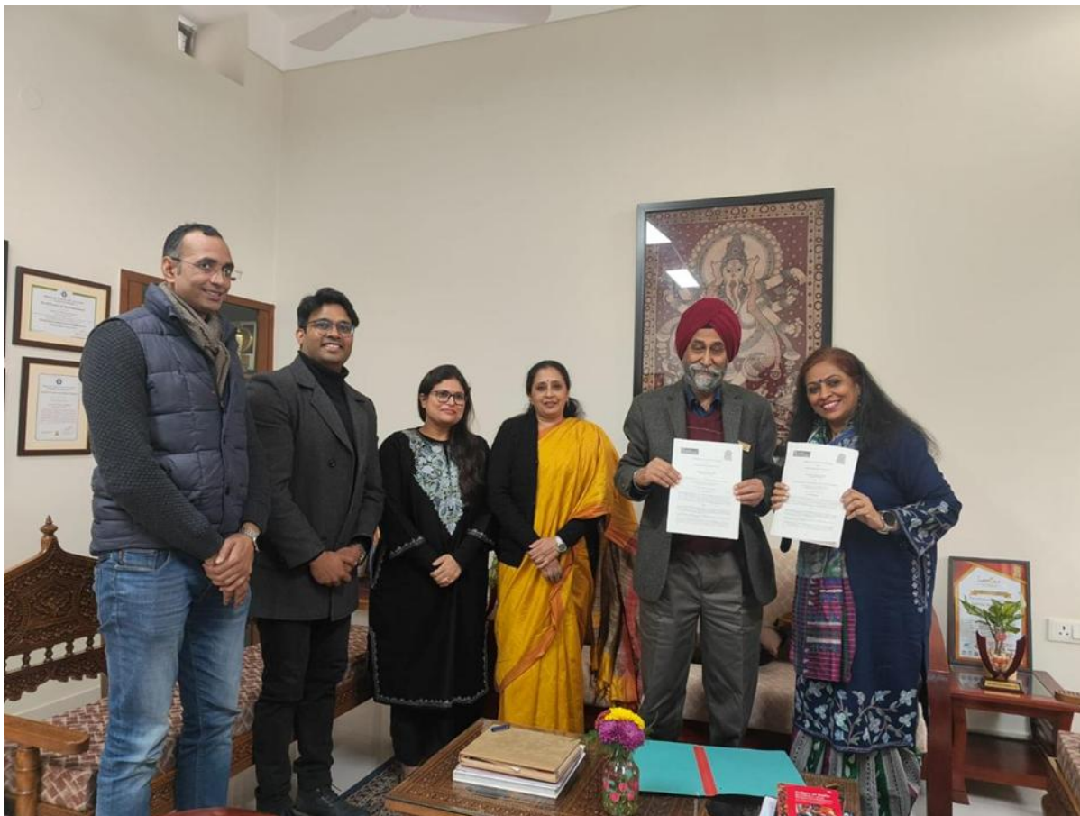
Signing MoU with the Rekhi Foundation for Happiness

आइ एस ओ 21001 : 2018 व आइ एस ओ 9001 : 2015 प्रमाणित एवं NAAC प्रत्यायित A+ महाविद्यालय An ISO 21001 : 2018 and ISO 9001 : 2015 Certified and NAAC Accredited 'A+' College