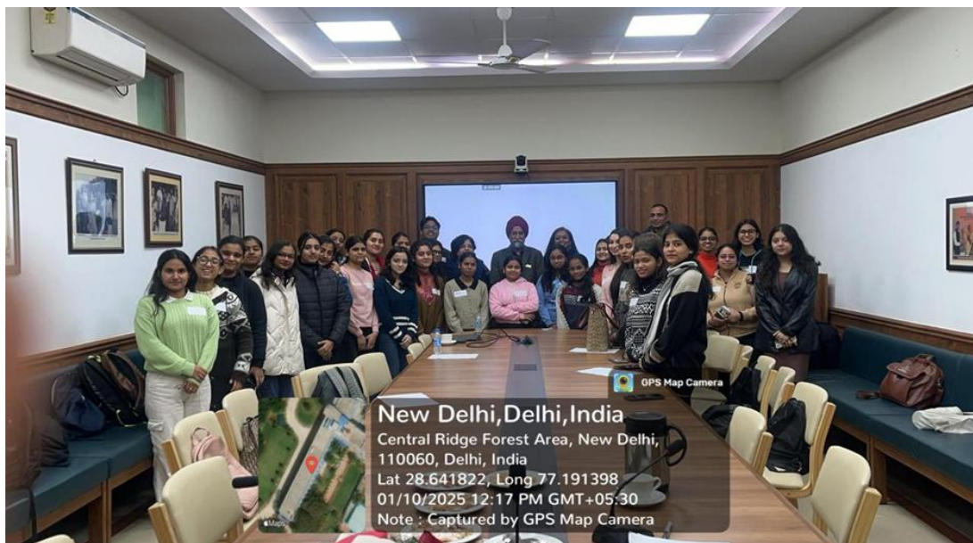
Seminar on 'The Science of Happiness'

आइ एस ओ 21001 : 2018 व आइ एस ओ 9001 : 2015 प्रमाणित एवं NAAC प्रत्यायित A+ महाविद्यालय An ISO 21001 : 2018 and ISO 9001 : 2015 Certified and NAAC Accredited 'A+' College