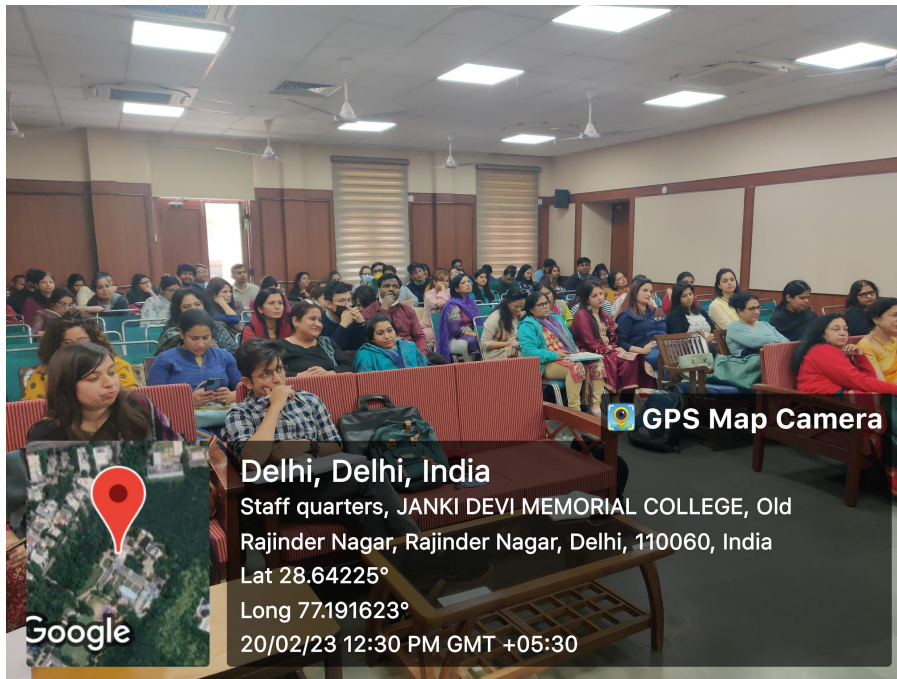
A Glimpse from the Faculty Pedagogy Series Lecture held on 20 February 2023