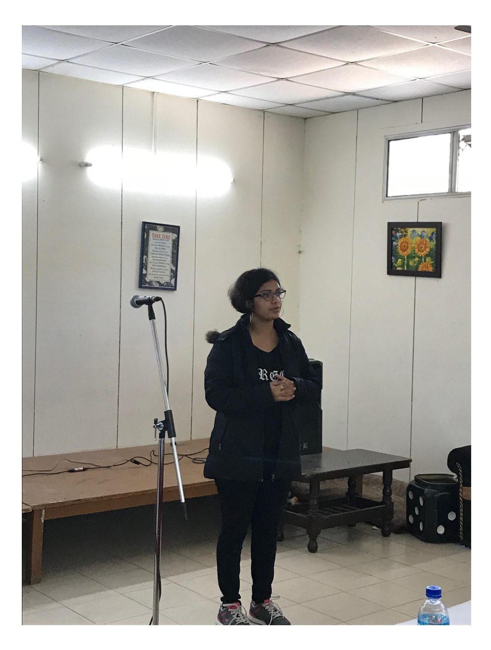
A Participant in action during Bardoratory: Slam Poetry held on 11 January 2018