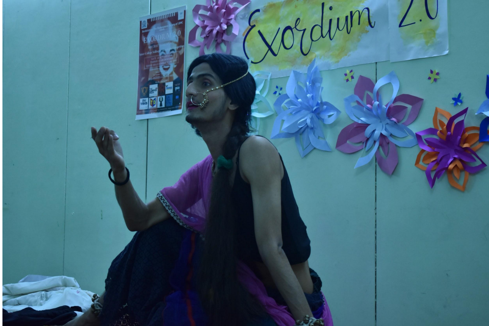
One of the Participants in action in Exordium 2.0 held on 21 October 2019