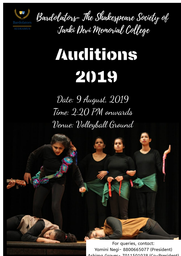
Poster for Auditions held by Bardolators on 9 August 2019