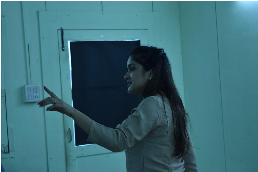
One of the Participants in action in Exordium 2.0 held on 21 October 2019