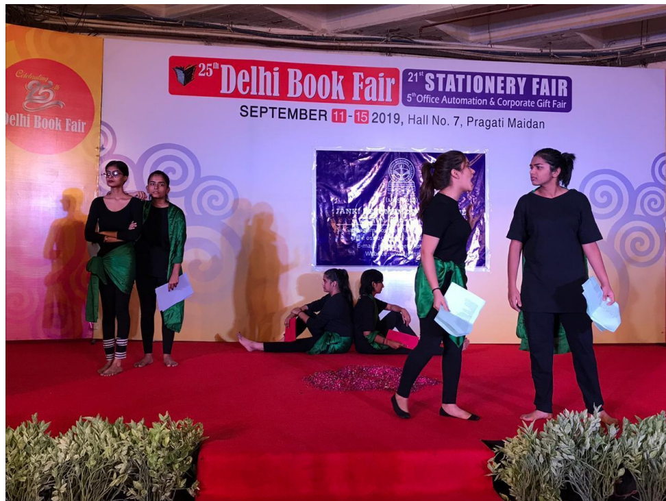
Bardolators Performing at the Delhi Book Fair on 12 September 2019