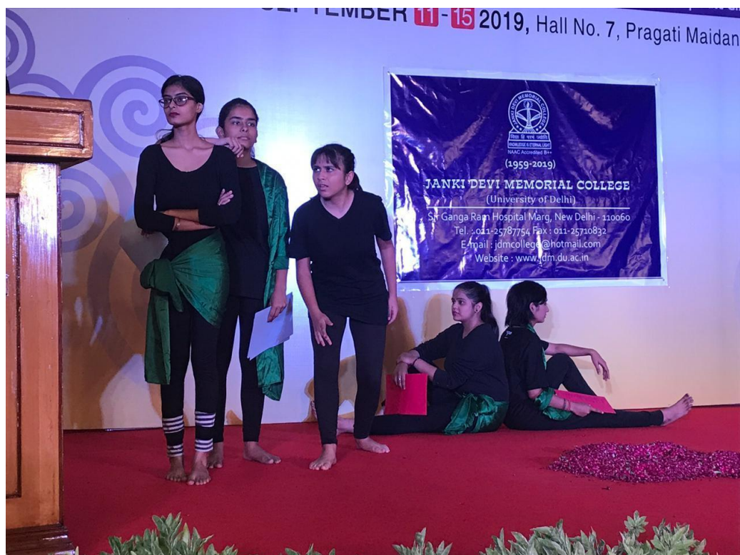
Bardolators Performing at the Delhi Book Fair on 12 September 2019