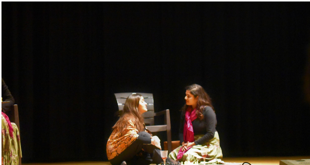
Bardolators Performing at the Annual Drama Competition conducted by SSI on 1 February 2020