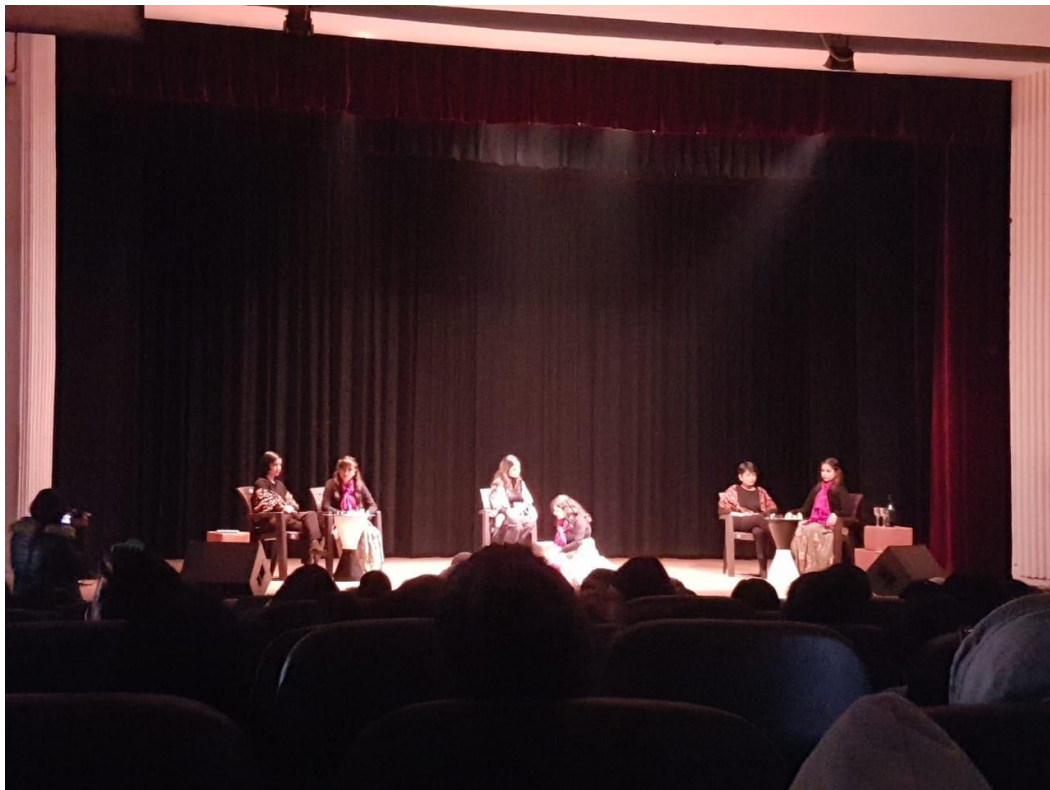
Bardolators Performing at the Annual Drama Competition conducted by SSI on 1 February 2020