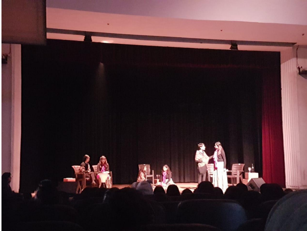
Bardolators Performing at the Annual Drama Competition conducted by SSI on 1 February 2020