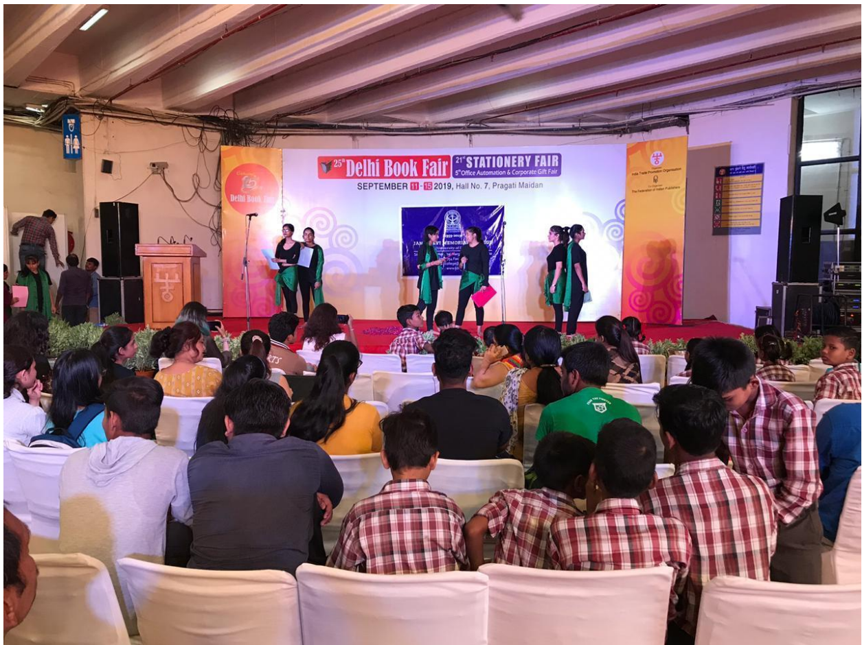
Bardolators Performing at the Delhi Book Fair on 12 September 2019

Bardolators performed at the 25th edition of the Delhi Book Fair on 12 September 2019. As a part of the college's cultural showcase, Bardolators presented a play, encompassing snippets of various Shakespearean dramas. Titled, "Rehearsing the Battle of the Sexes", the play explored the dynamics between male and female characters in Shakespeare's writing. The acts represented in the play were taken from A Midsummer Night's Dream , Much Ado About Nothing , The Taming of the Shrew , and Piya Behrupiya (an adaptation of Twelfth Night by The Company Theatre). The play received tremendous applause and appreciation from the audience.