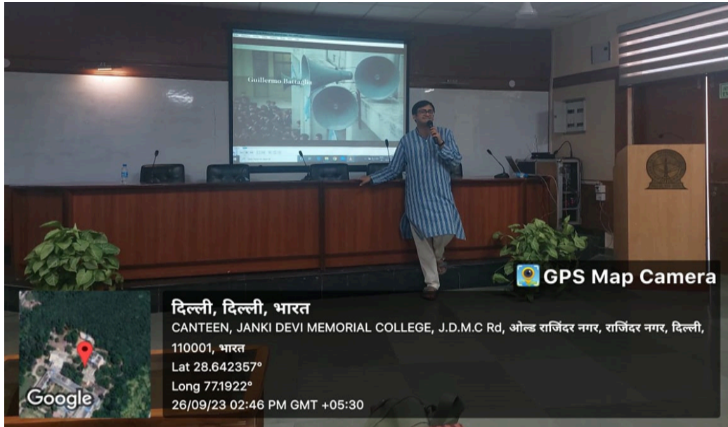
Glimpses from the Movie Screening of The Official Story organised by Bardolators on 26 September 2023