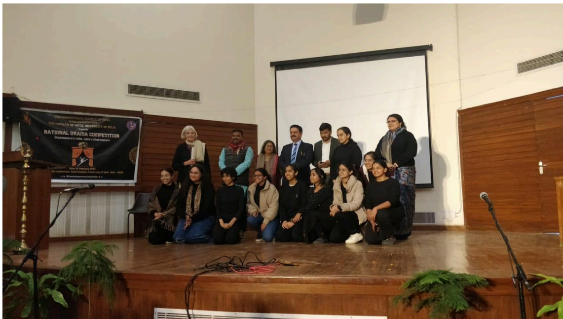
Bardolators Receiving the Prize for Best Costume at the National Drama Competition conducted by SSI on 10 February 2024