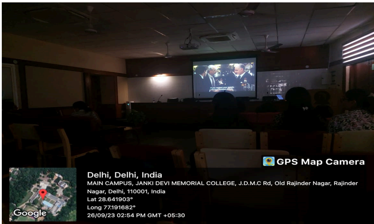
Glimpses from the Movie Screening of The Official Story organised by Bardolators on 26 September 2023