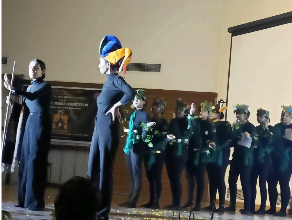
Glimpses from the Performance at the National Drama Competition conducted by SSI on 10 February 2024