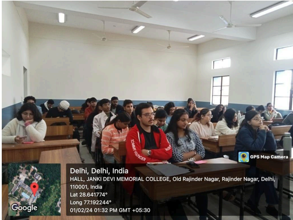
Glimpses from Bardoratory 2024 held as part of Symphony 2024 on 1 February 2024