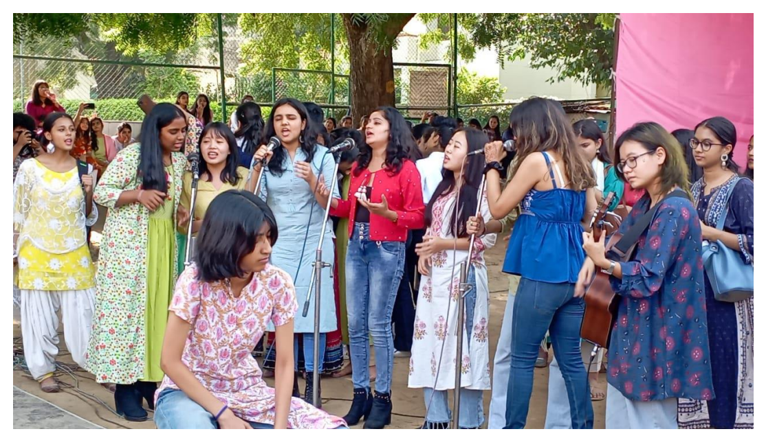
2 EUPHONIE PERFORMANCE AT DIWALI MELA 2022-23

Performance at the Diwali Mela: Euphonie in collaboration with Sarang (Indian Music Society JDMC) performed at the Diwali Mela, organized at JDMC on the 19<sup>th</sup> of October 2022. The medley included songs like Bad Romance, Take me to Church, Beggin, and Believer . It was a wonderful festive collaboration and was greatly enjoyed by all.