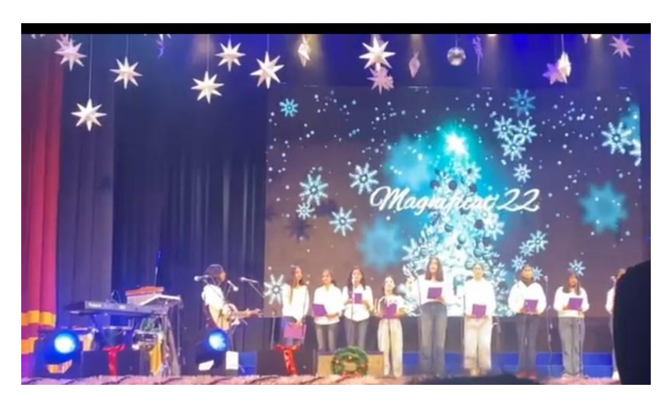
13 EUPHONIE COMPETING IN CAROL SINGING COMPETITION MAGNIFIQUE 22