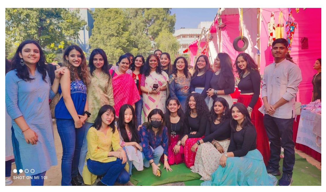
3 EUPHONIE & SARANG, DIWALI MELA