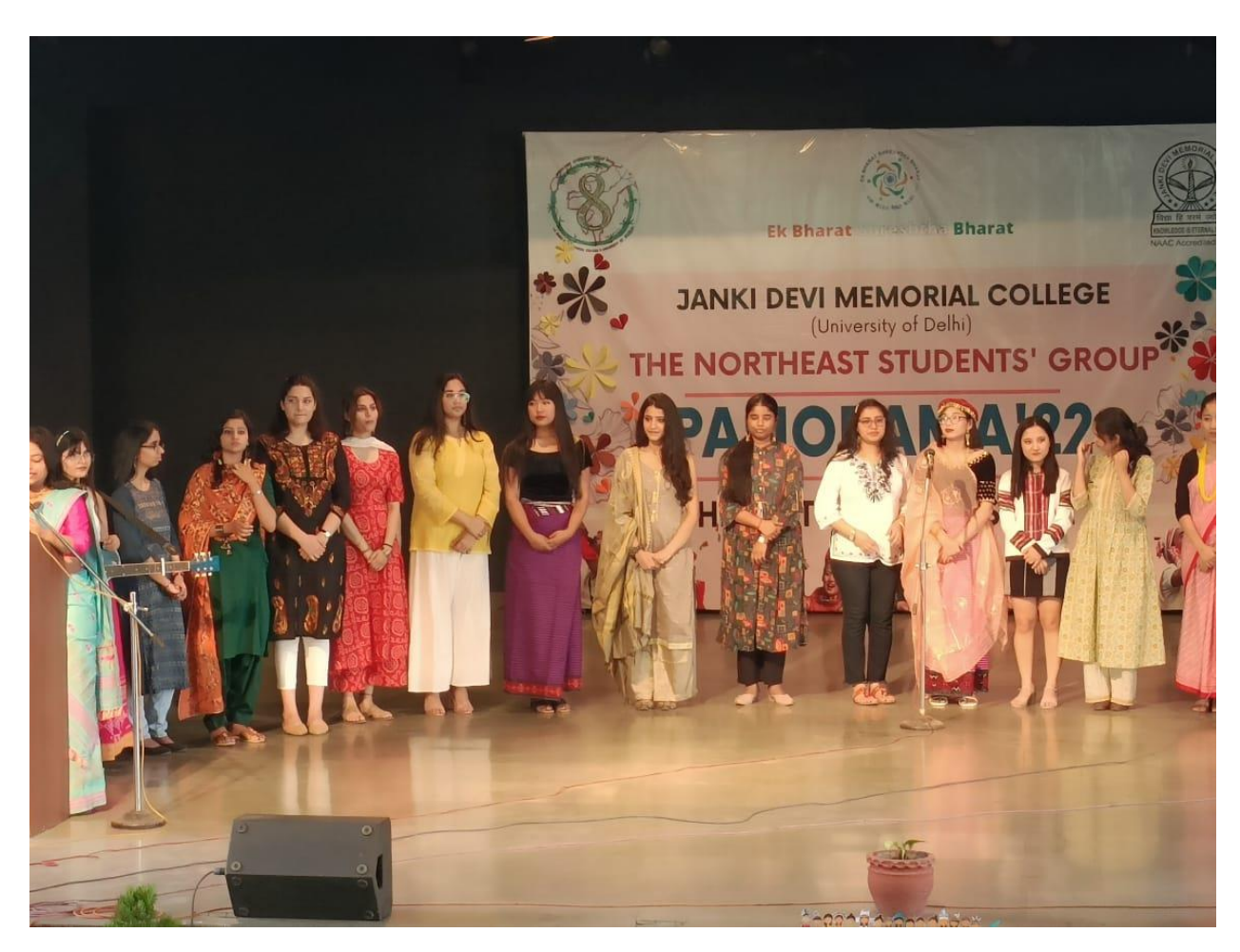
1EUPHONIE PERFORMANCE AT NORTHEAST FESTIVAL, PANORAMA

Euphonie Performed a medley of folk songs in the languages of the North East on the occasion of the North East Student's Group Festival Panorama 20<sup>th</sup>April, 2022. Synchronised harmonies captured the feel of the North East Indian Rhythms rejoicing in the name of one united nation that stands together, breathes together and sings together. The performance was widely appreciated.