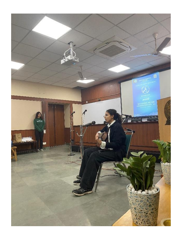
{\bf 8} solo performer, w. music competition