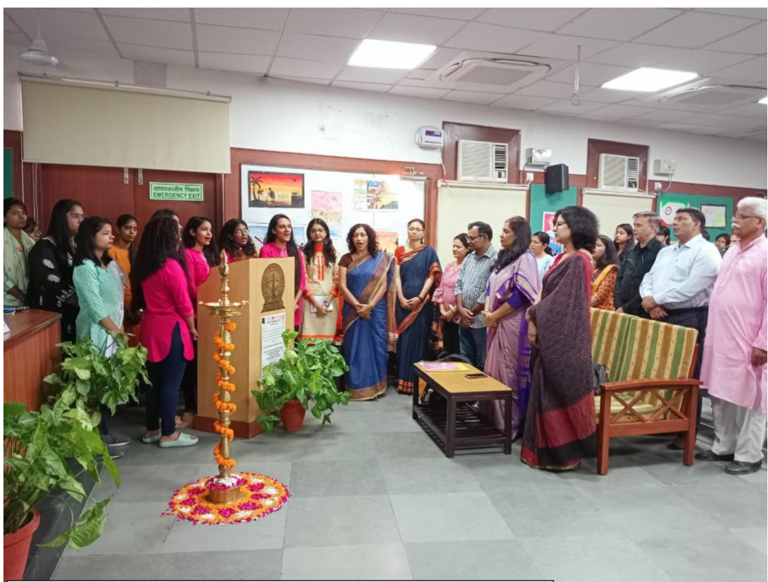
The Lighting of the Lamp and College Prayer