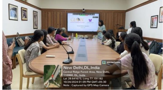
New Delhi, DL, India Central Ridge Forest Area, New Delhi, 110060, DL, India Lat 28.641673, Long 77.191182 10/24/2024 01:09 PM GMT+05:30 Note : Captured by GPS Map Camera