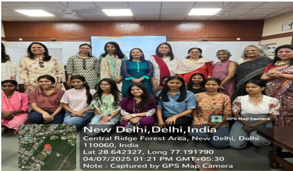
New Delhi, Delhi, India Central Ridge Forest Area, New Delhi, Delhi 110060, India Lat 28.642327, Long 77.191790 04/07/2025 01:21 PM GMT+05:30 Note : Captured by GPS Map Camera