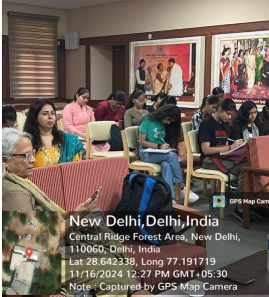
New Delhi, Delhi, India Central Ridge Forest Area, New Delhi, 110060, Delhi, India Lat 28.642338, Long 77.191719 11/16/2024 12:27 PM GMT+05:30 Note : Captured by GPS Map Camera