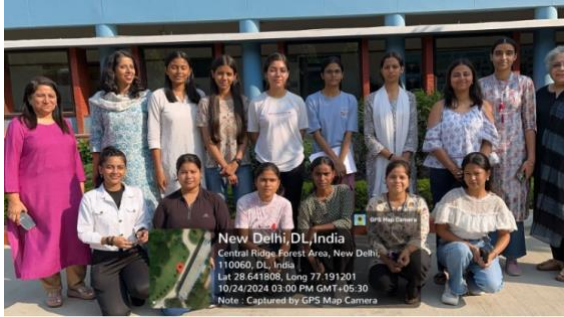
New Delhi, DL, India Central Ridge Forest Area, New Delhi, 110060, DL, India Lat 28.641808, Long 77.191201 10/24/2024 03:00 PM GMT+05:30 Note : Captured by GPS Map Camera