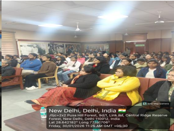
New Delhi, Delhi, India 🇮🇳 J5jc+2x2 Pusa Hill Forest, 9d/1, Link Rd, Central Ridge Reserve Forest, New Delhi, Delhi 110012, India Lat 28.642182° Long 77.191705° Friday, 30/01/2026 11:25 AM GMT +05:30