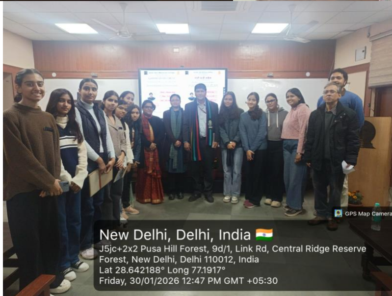
New Delhi, Delhi, India 🇮🇳 J5jc+2x2 Pusa Hill Forest, 9d/1, Link Rd, Central Ridge Reserve Forest, New Delhi, Delhi 110012, India Lat 28.642188° Long 77.1917° Friday, 30/01/2026 12:47 PM GMT +05:30