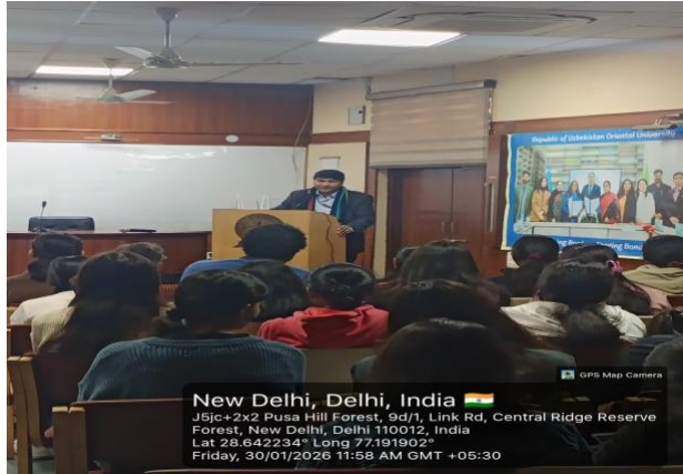
New Delhi, Delhi, India 🇮🇳 J5jc+2x2 Pusa Hill Forest, 9d/1, Link Rd, Central Ridge Reserve Forest, New Delhi, Delhi 110012, India Lat 28.642234° Long 77.191902° Friday, 30/01/2026 11:58 AM GMT +05:30