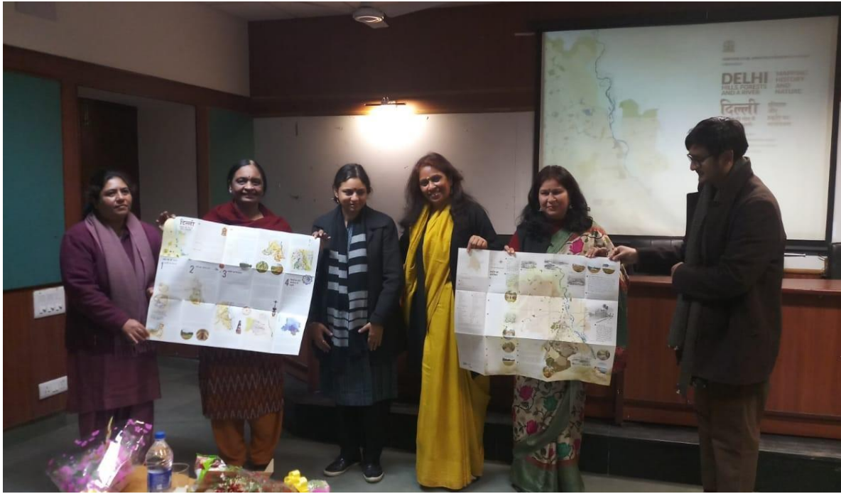
Some glimpses from the lecture 'Delhi: A City of Hills, Forests and a River' on 11 February 2019