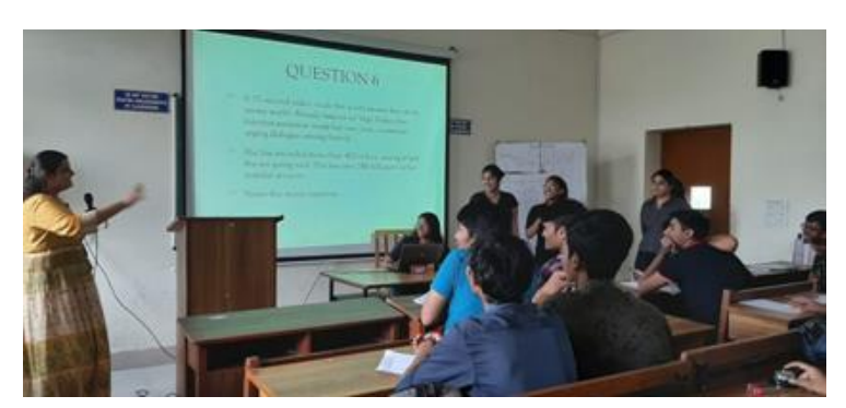
Final Round of Quizonics 2019