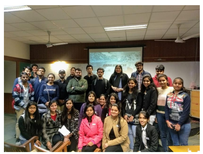
InQuizition team with all the Prize Winners: Q&A 2019