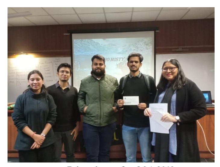
Prize winners for Q&A 2019