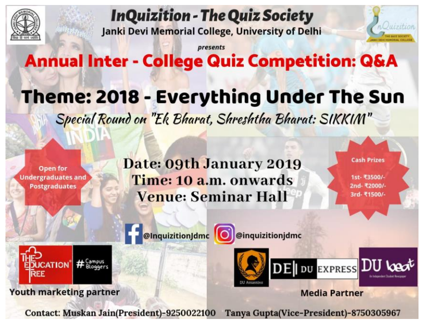
Poster for Q&A 2019

Media Link: <a href="https://www.instagram.com/p/BsfsrWYnqaM/?utm_medium=copy_link">https://www.instagram.com/p/BsfsrWYnqaM/?utm_medium=copy_link</a>