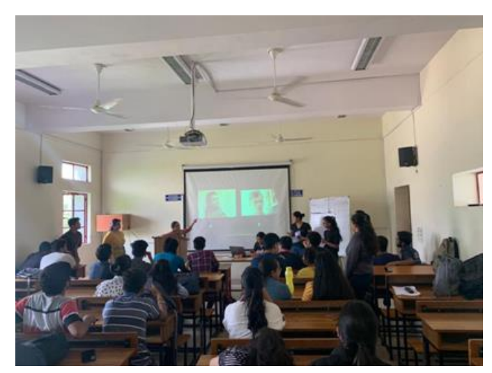
Quizonics 2019: Event Underway