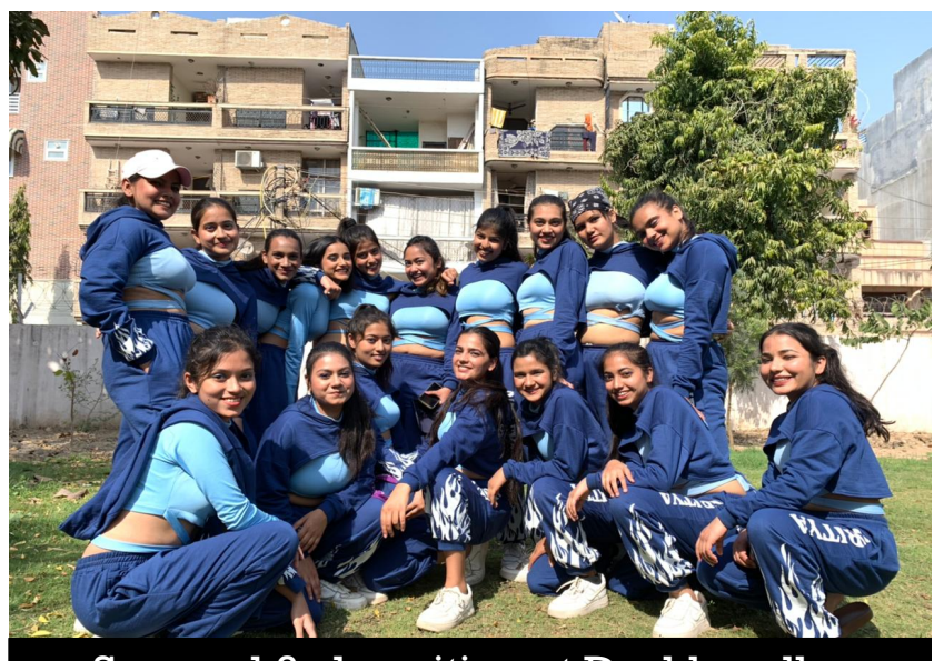
Secured 3rd position at Deshbandhu college