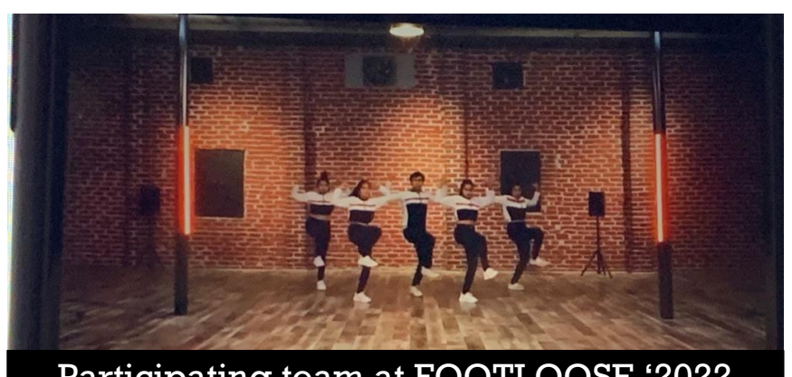
Participating team at FOOTLOOSE '2022