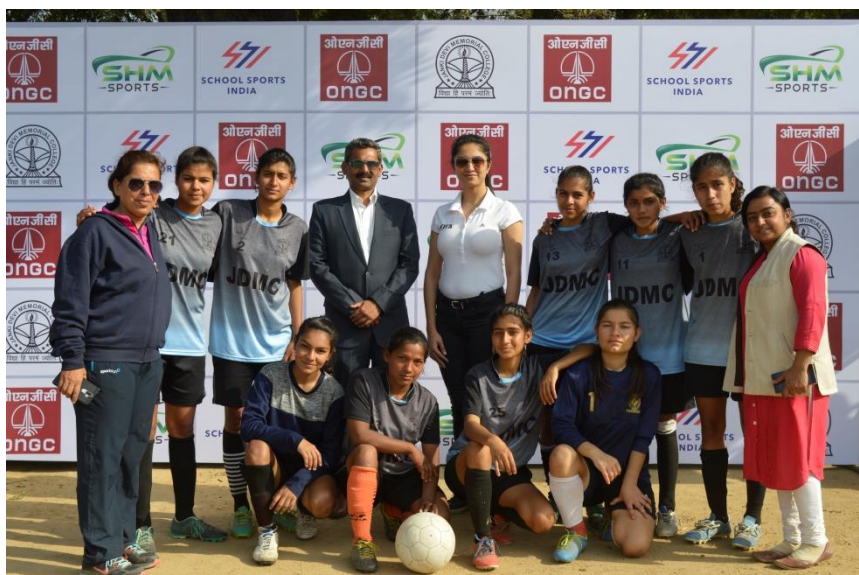
TEAM IN SHM TOURNAMENT @ JDMC FOOTBALL GROUND