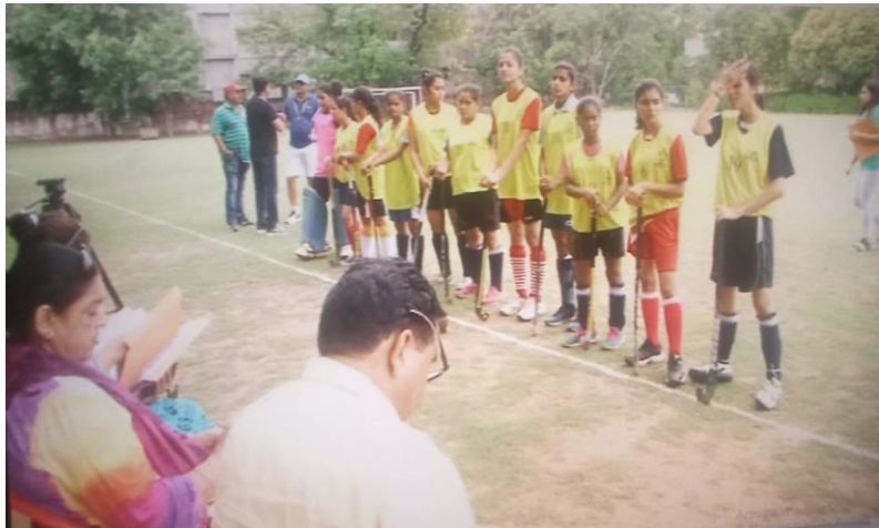
DU SPORTS COMMITTEE FOR HOCKEY TRIALS