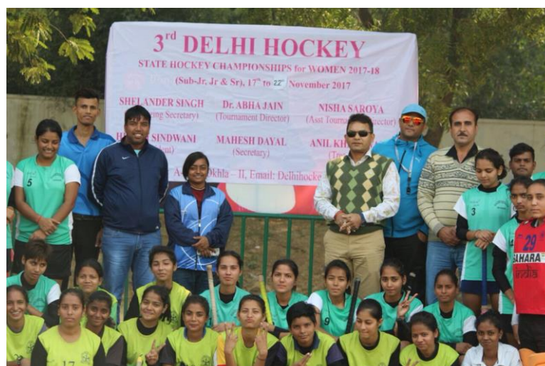
3 RD DELHI STATE HOCKEY CHAMPIONSHIP @JDMC GROUND