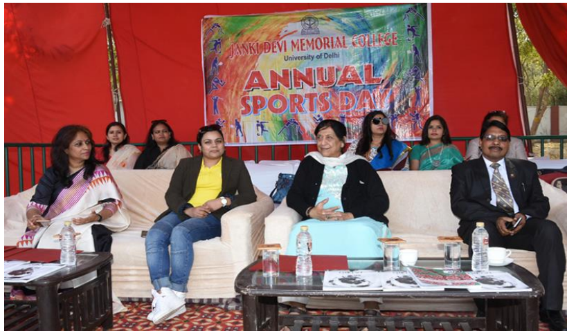
Sports Contingent on Sports Day