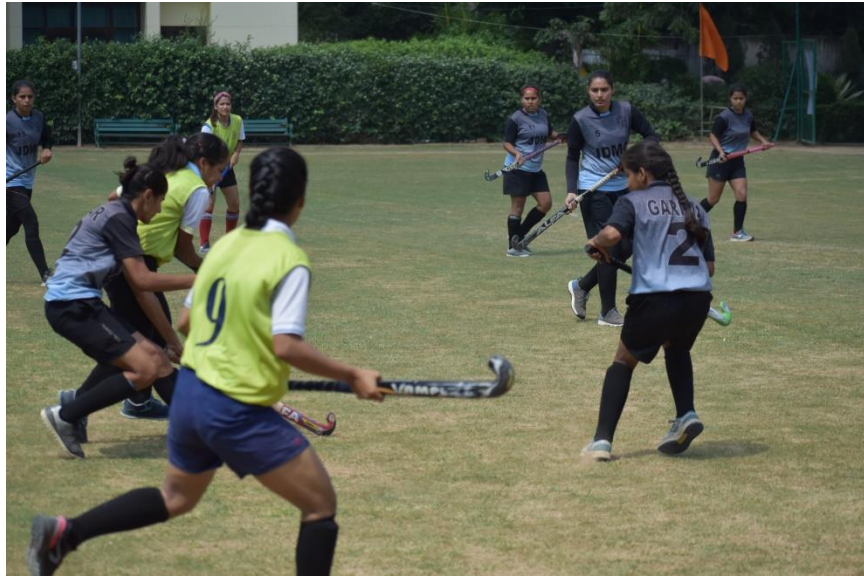
INTER COLLEGE HOCKEY CHAMPIONSHIP @JDMC