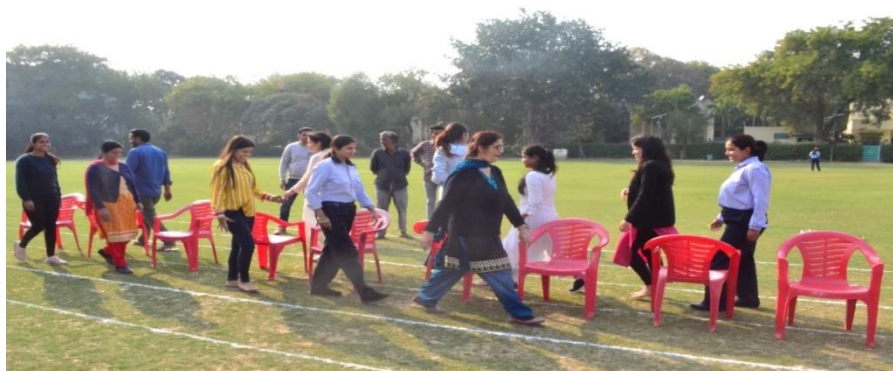
Staff Musical Chair event on Sports Day