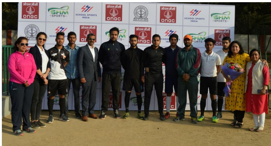
SHM FOOTBALL TOURNAMENT ORGANISERS