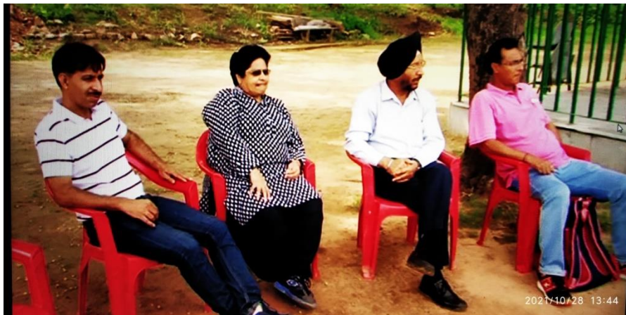
SPORTS COMMITTEE FOR DU SPORTS QUOTA TRIALS IN FOOTBALL