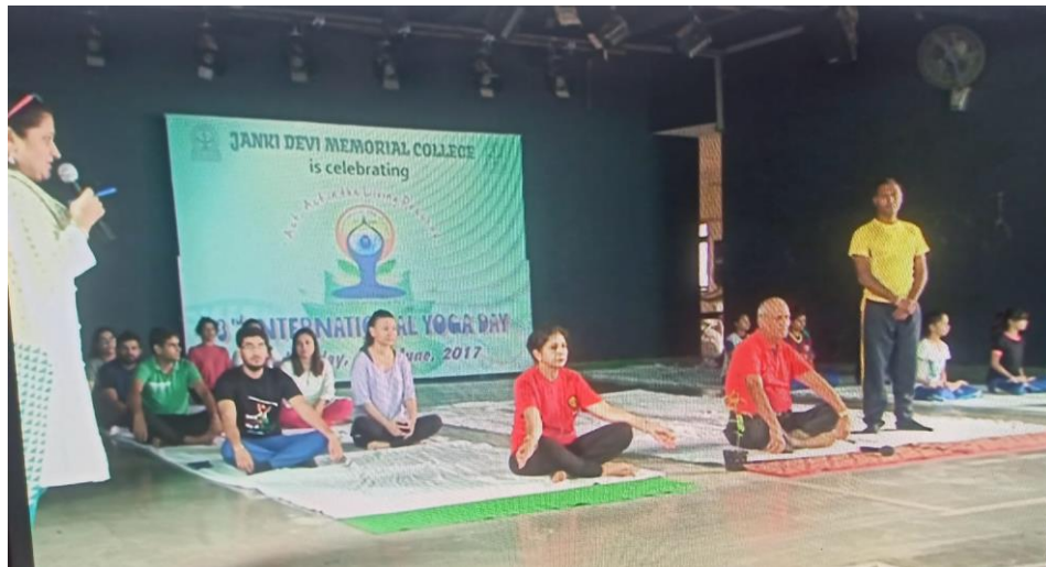
3 rd International Yog Day on June 21, 2017