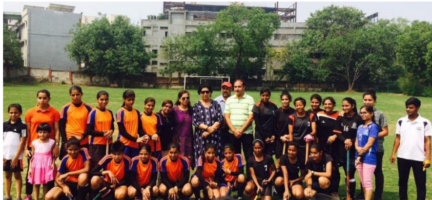
Delhi state Hockey Championship