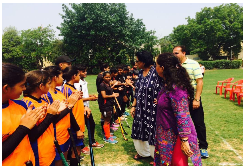
DELHI STATE 6- A- SIDE HOCKEY LEAGUE @ JDMC-CELEBRATION OF OLYMPIC DAY