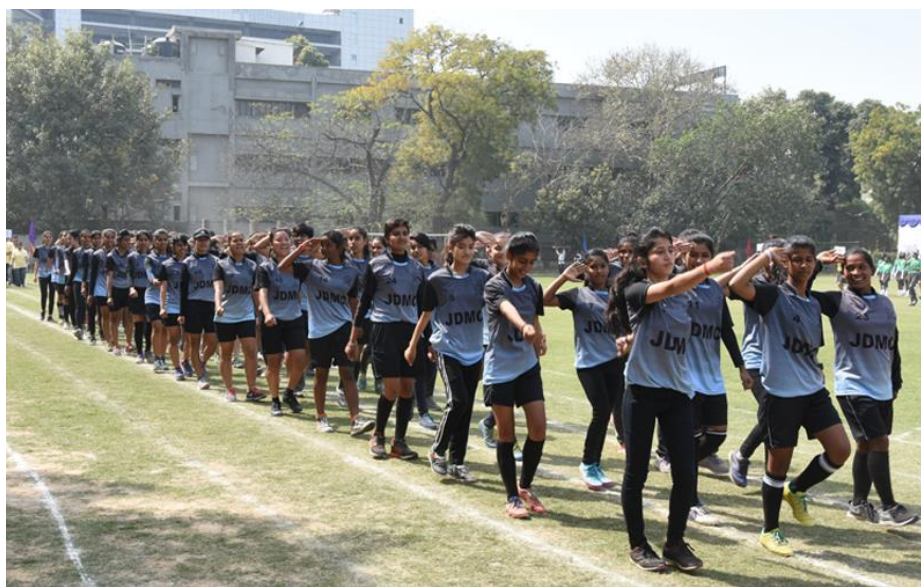
Sports Contingent on Sports Day