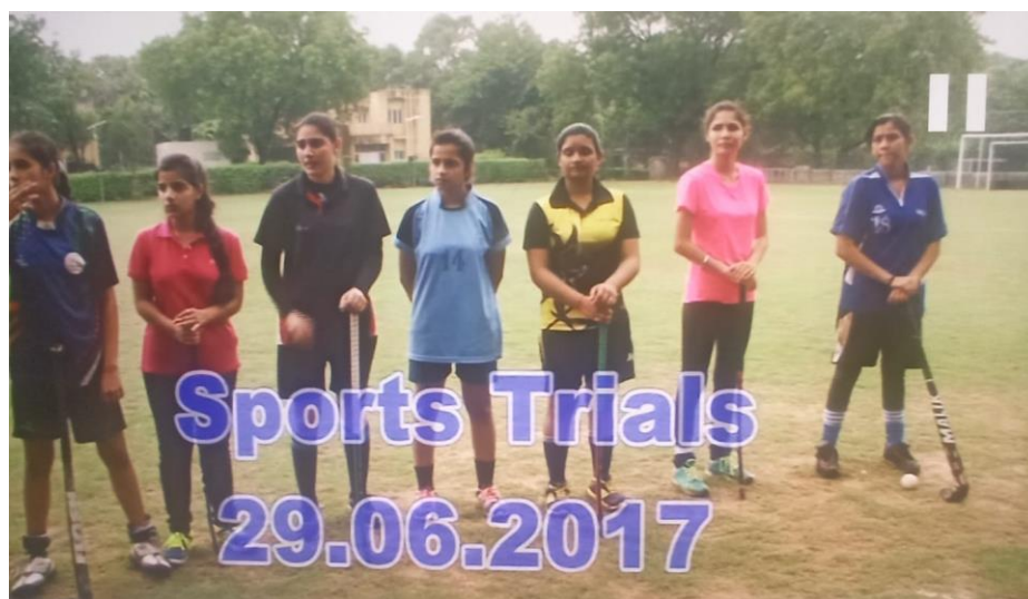
HOCKEY APPLICANTS FOR DU SPORTS QUOTA TRIALS