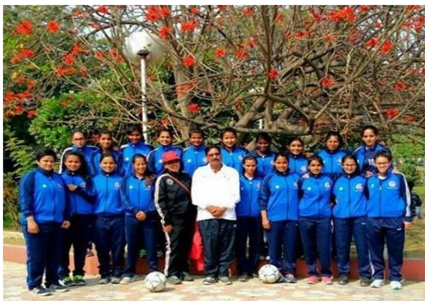
MANAGER, DELHI UNIVERSITY FOOTBALL TEAM - 2 ND IN NORTH ONE INTER UNIVERSITY TOURNAMENT