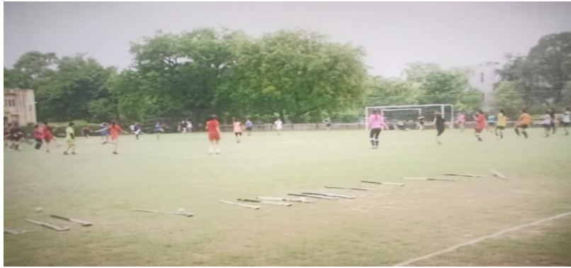
DU SPORTS QUOTA TRIALS FOR HOCKEY IN PROCESS