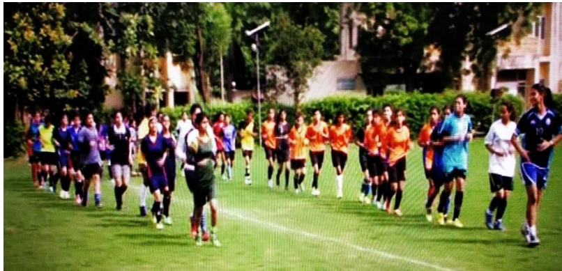
DU SPORTS QUOTA TRIALS FOR HOCKEY IN PROCESS