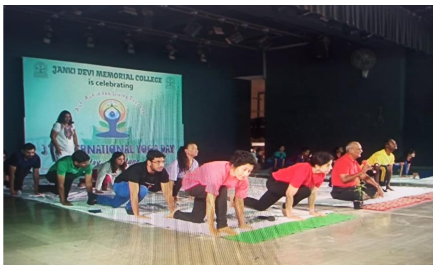
3 rd International Yog Day on June 21, 2017