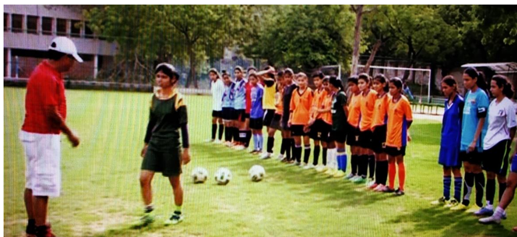
DELHI UNIVERSITY SPORTS QUOTA TRIALS FOR FOOTBALL