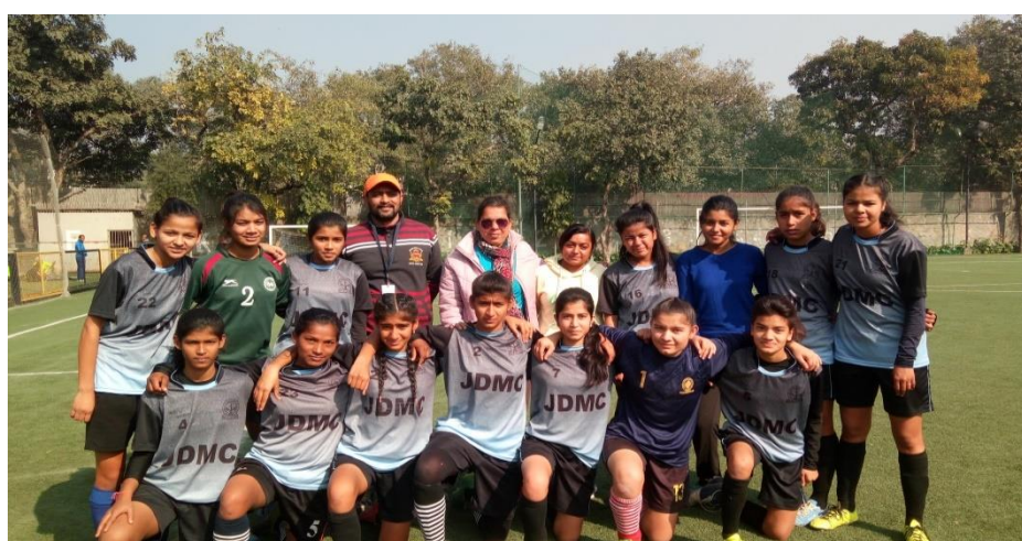
JDMC Football Team – 2 nd Inter College Football Tournament