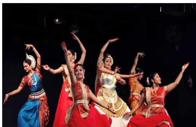
Performances of Nupur students at the Teachers' Day function on 5 September 2019