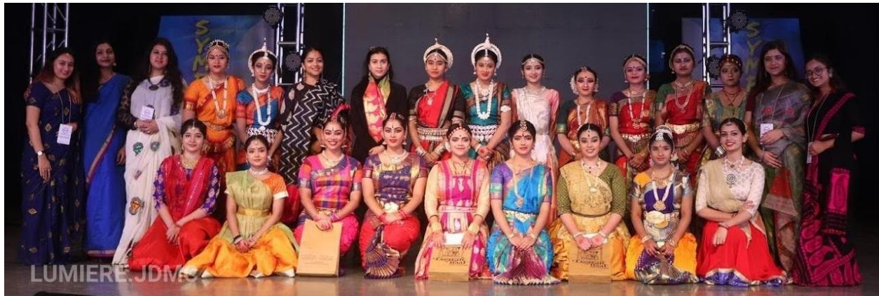
Participants and Judges of Aradhi, with students of Nupur, 10 January 2020