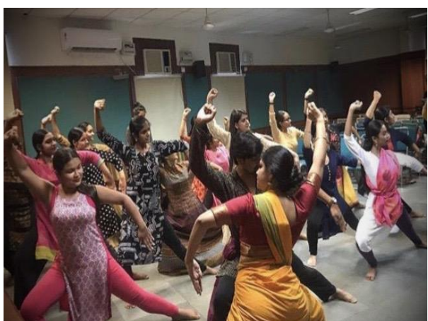
Glimpses from the Bharatnatyam and Chhau Workshop, 25 September 2019