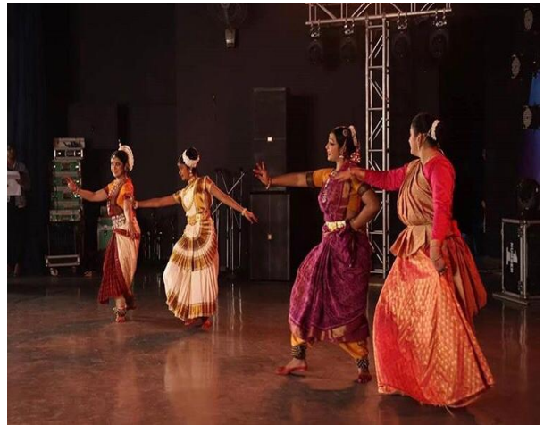
Glimpses from Symphony Inaugral, 8 January 2020