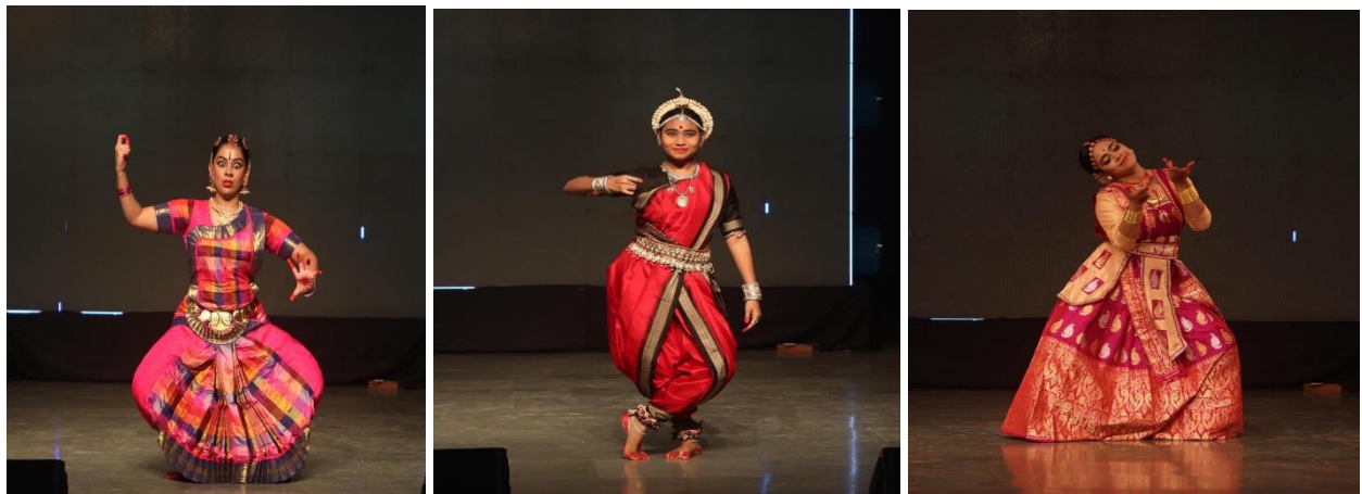
Some glimpses of Aradhi, 10 January 2020