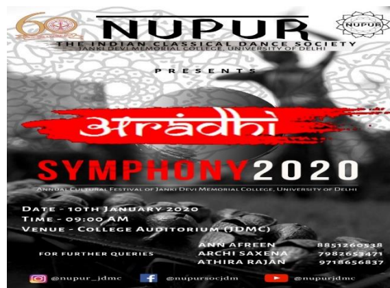
Poster of Aradhi, 10 January 2020