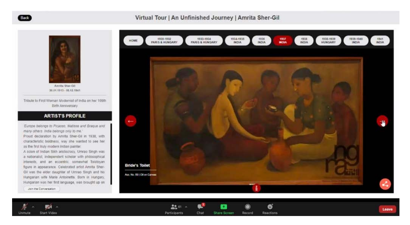
Day 2, Virasat 2021, Virtual Tour to National Gallery of Modern Art, New Delhi

Shergil, Nicholas Roerich, Nand Lal Bose and Jamini Roy was displayed with very insightful information about the artwork and artist. The heritage walk ended with the much awaited 360 degree virtual tour where the participants were able to experience a visit to NGMA virtually. There were around 107 attendees for the event. The tour was followed by a Question and Answer session where the curious questions of all the excited participants were addressed. The importance of museums was emphasized upon by calling them a "visual library" where everything can be understood with the help of visual references. The event was concluded with a vote of thanks presented by the president and teacher coordinator of SPIC MACAY JDMC Chapter.