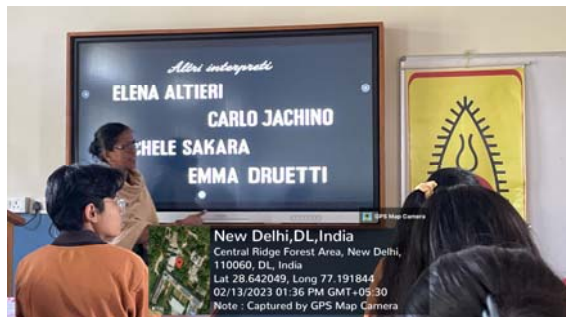
The screening of the movie.

To celebrate the notable director, Vittorio de Sica, his famous 1948 release, Bicycle Thieves, was screened on 13th February 2023 in room 68 from 12:00 p.m which was followed by a discussion about the movie.