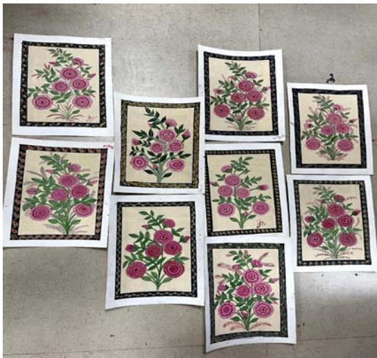
The final paintings of participants.