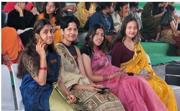
The core team of SPIC MACAY JDMC Chapter at the concert.