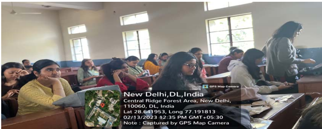
The audience at the movie screening.