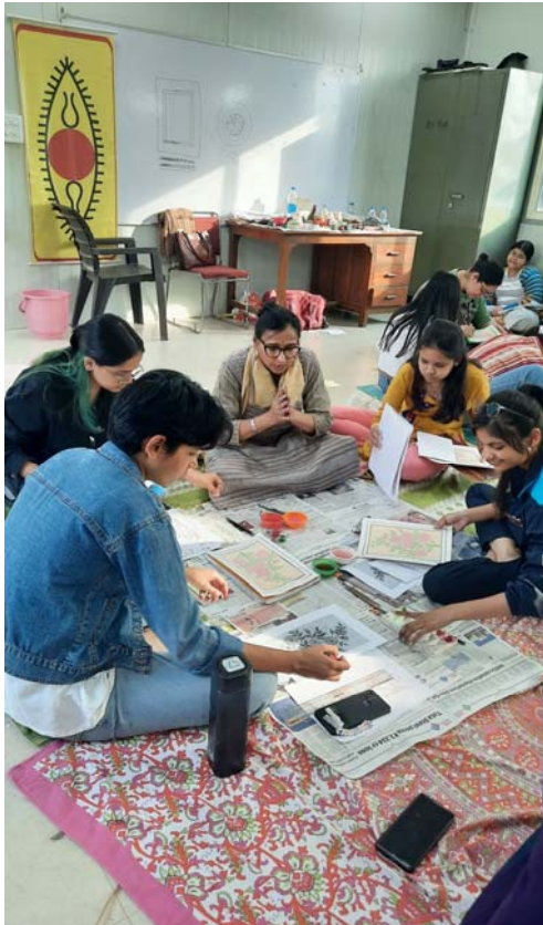
The participants at work.