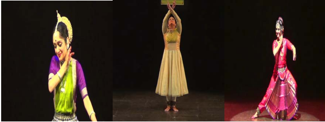
The artists at the concert.