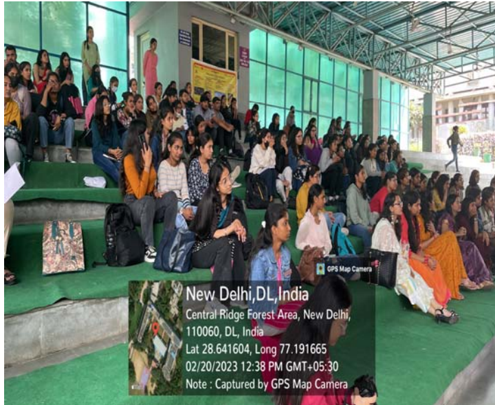
The audience at the performance.