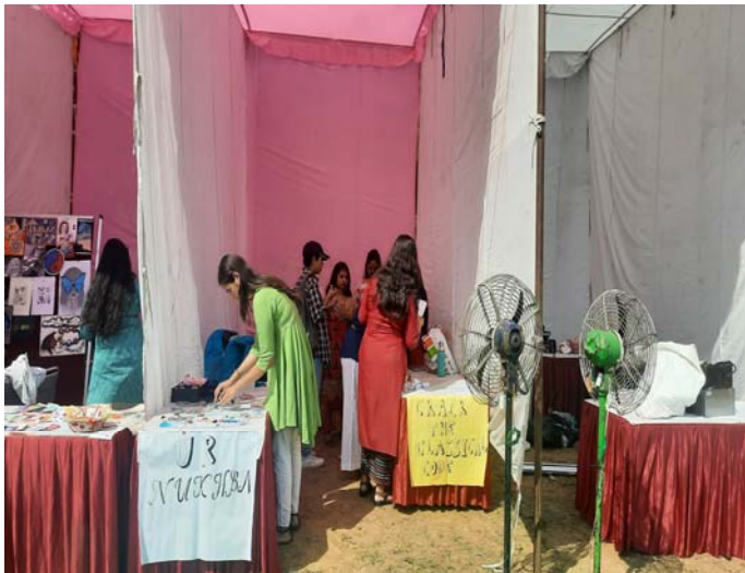
JDMC SPIC MACAY Chapter volunteers busy at the stall.