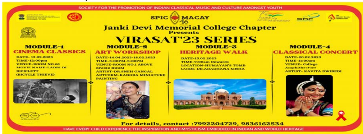
Poster for Virasat'23.

The 2023 Virasat Series of JDMC Chapter was a week long programme from 13th February 2023 to 20th February 2023, divided into four modules: