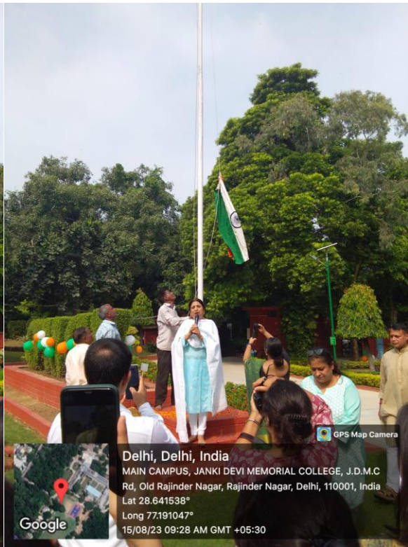
Delhi, Delhi, India MAIN CAMPUS, JANKI DEVI MEMORIAL COLLEGE, J.D.M.C Rd, Old Rajinder Nagar, Rajinder Nagar, Delhi, 110001, India Lat 28.641523° Long 77.19102° 15/08/23 09:28 AM GMT +05:30